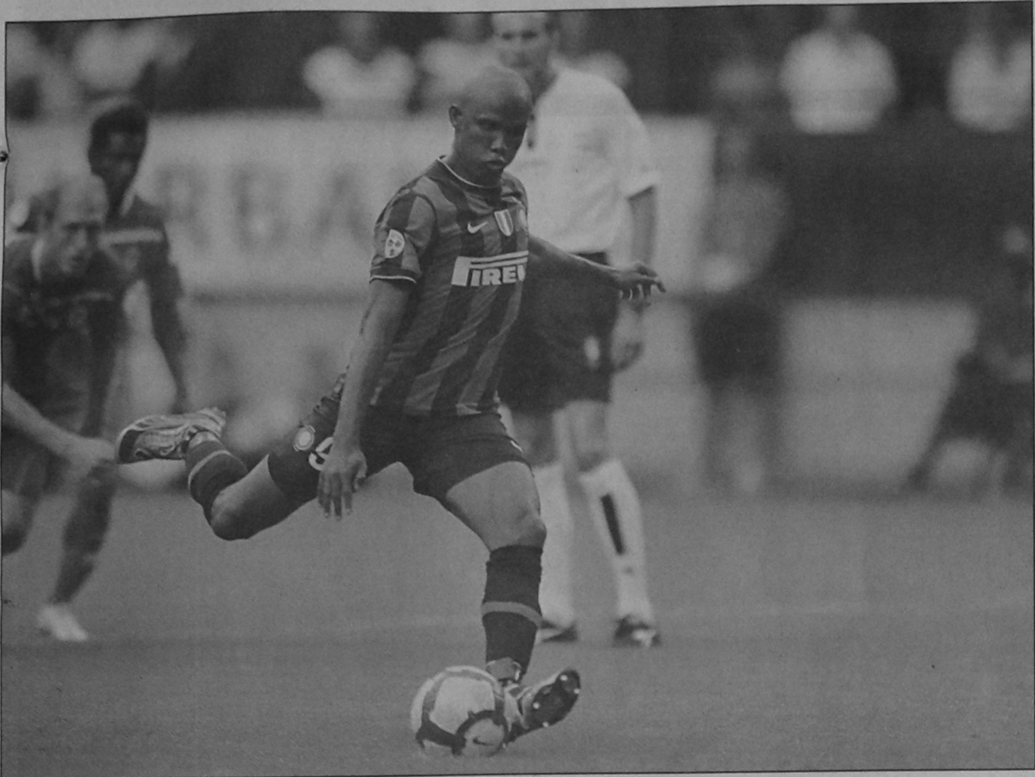
Inter Milan striker Samuel Eto'o takes a shot during their Serie A tie against Bari at San Siro on Sunday.