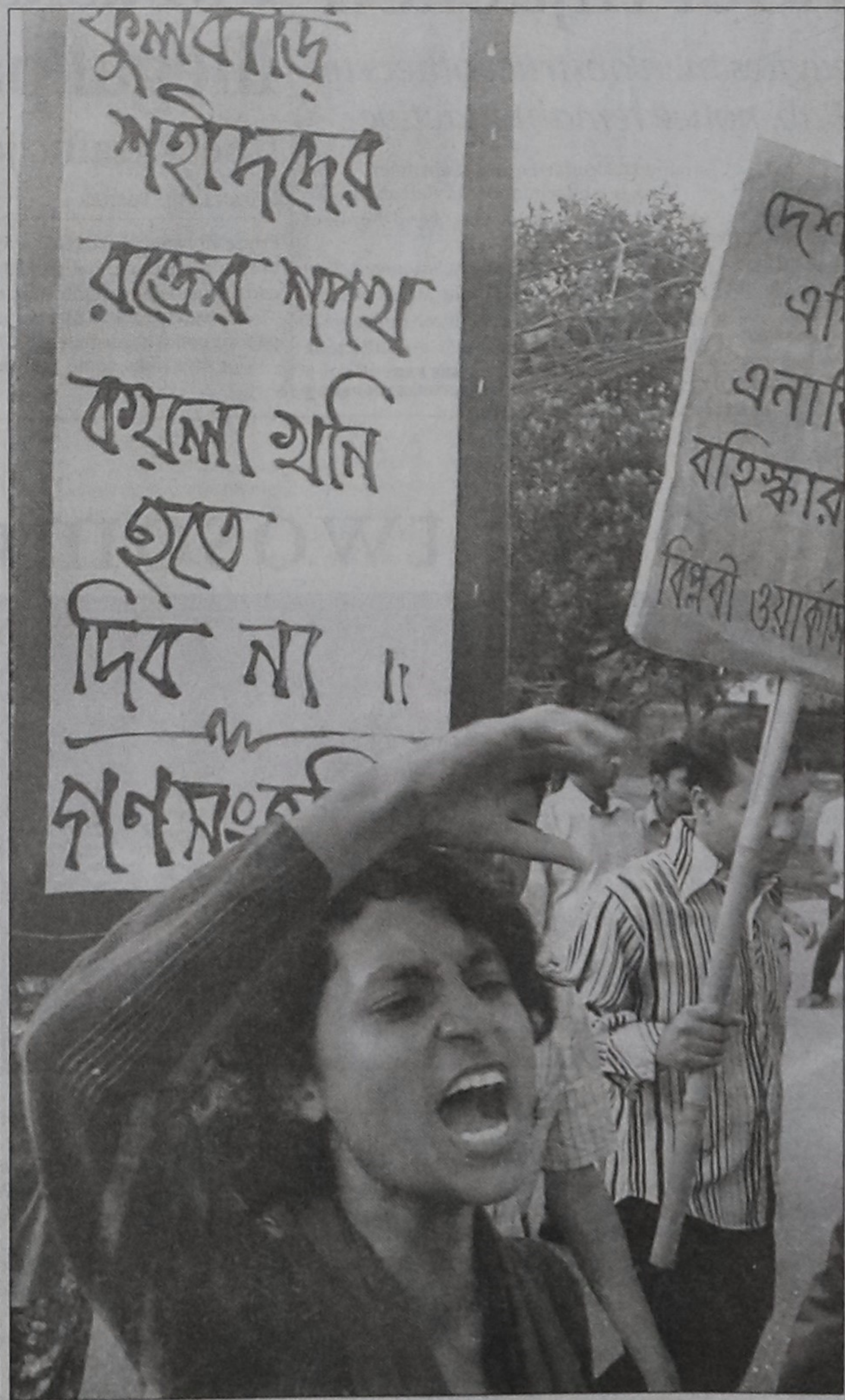
Left Democratic Front stages a demonstration at Muktangan in the city yesterday demanding implementation of the Phulbari agreement.