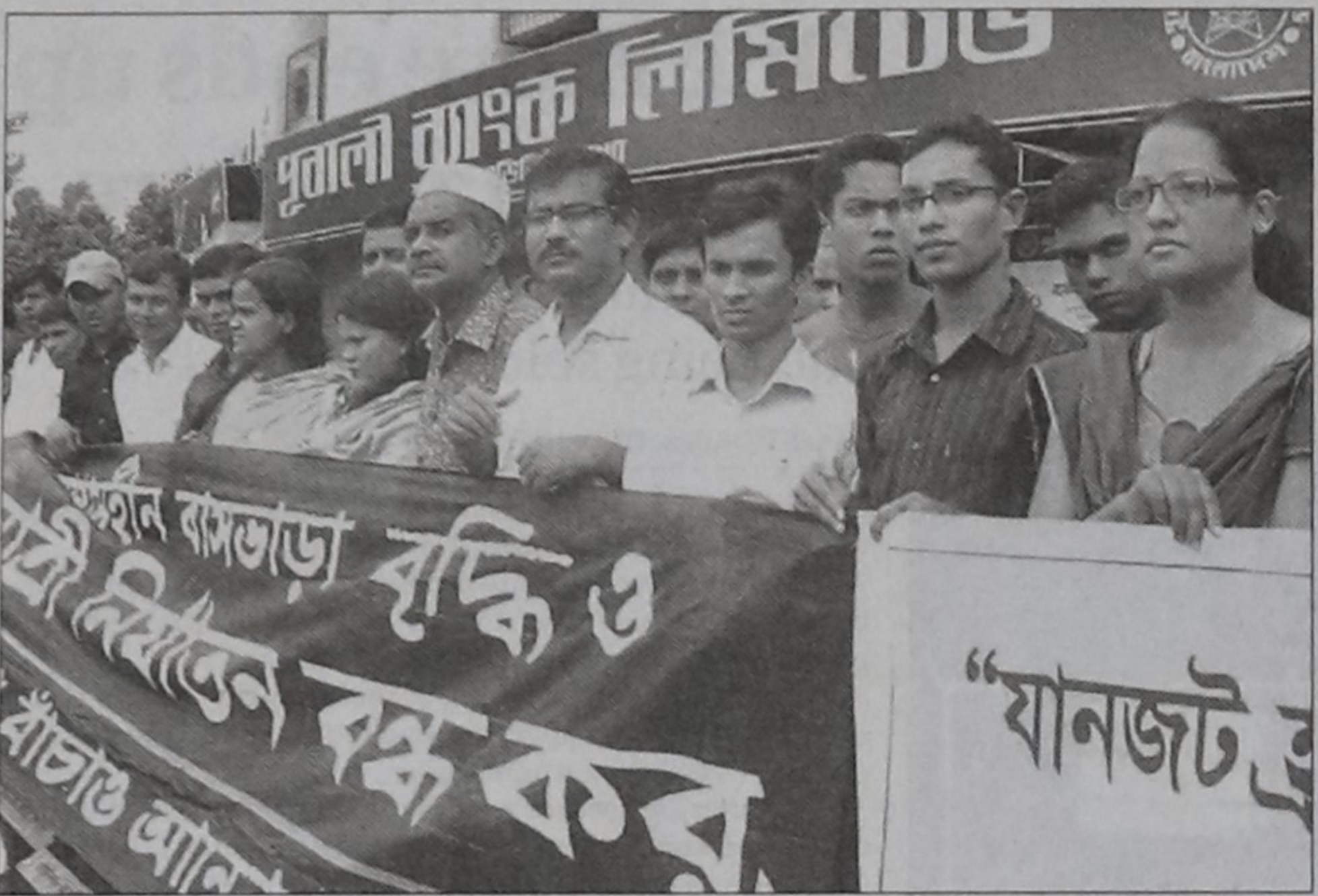
Paribesh Bachao Andolon, Citizen Rights Movement, Nirapad Development Foundation, Prottyasha and WBB Trust form a human chain in front of Bangabandhu Sheikh Mujib Medical University (BSMMU) yesterday with a call to take steps to ease traffic jam in the city. (Story on Page 5)