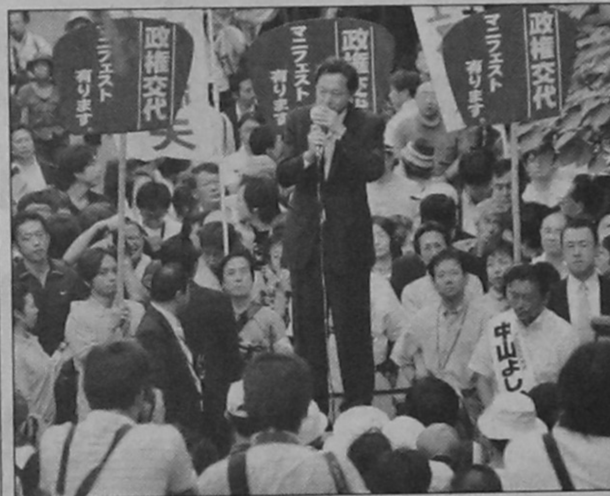
Japan's main opposition Democratic Party of Japan (DPJ) leader Yukio Hatoyama (C) delivers a speech as he visits a shopping mall during a stump tour for the August 30 general election in Tokyo yesterday.

After daybreak Sunday, planes and helicopters resumed water drops following an eight-hour pause that allowed the wildfire to spread across parts of Mount Penteli and reach suburban homes. Clouds of black smoke filled the capital's skyline and obscured the sun.