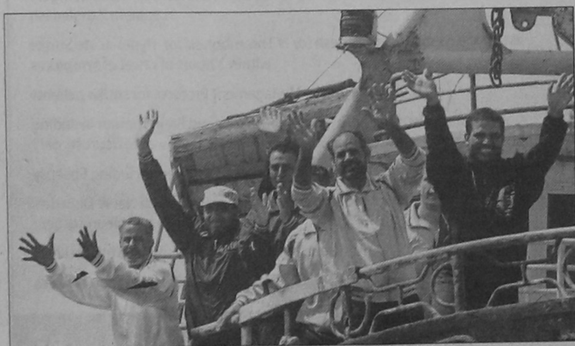
Crewmembers of the Egyptian fishing ship Momtaz I wave as they arrive at the port in Ataka, 170km northeast of Cairo yesterday. More than 30 Egyptian fishermen who were held hostage by Somali pirates for four months returned home with eight of their former captors held captive in their boats' refrigerated holds.

But a Scottish government spokesman said the decision was reached following proper procedures.