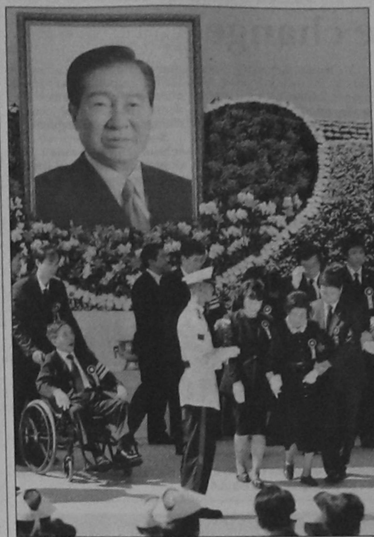
Lee Hee-Ho (3rd R), wife of the late former South Korean president Kim Dae-Jung, and her family walk past the memorial altar for Kim during a state funeral ceremony at the National Assembly in Seoul yesterday.

Between 30 and 40 prisoners are held in Iraq and a smaller number in Afghanistan, military officials told the Times.