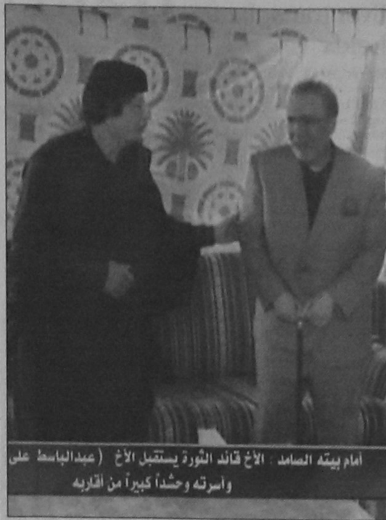
In this image grab taken from a newscast on Libya's official television, Libyan leader Muammar Gaddafi (L) welcomes freed Lockerbie bomber Abdelbaset Ali Mohmet al-Megrahi inside his tent in Tripoli on Friday.

"I am against belittling women. We have to carve out the way," he said.