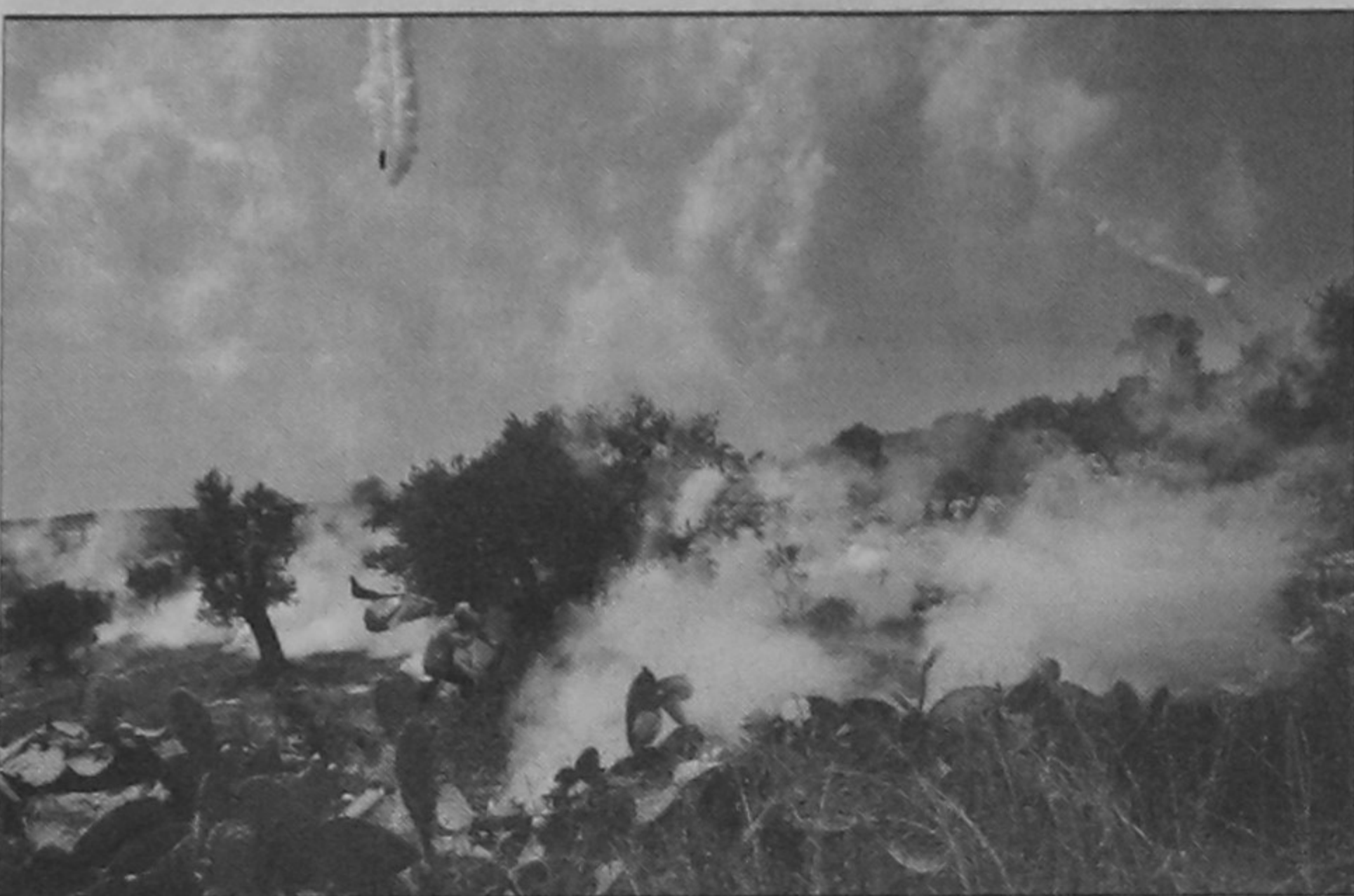
A Palestinian protester runs for cover from tear gas fired by Israeli soldiers during a demonstration against Israel's controversial separation barrier in the West Bank village of Nilin, near Ramallah, on Friday.

Gaddafi went on to cite "my friend Brown, the Prime Minister of Britain, his government, the Queen of Britain, Elizabeth, and Prince Andrew, who all contributed to encouraging the Scottish government to take this historic and courageous decision, despite the obstacles."