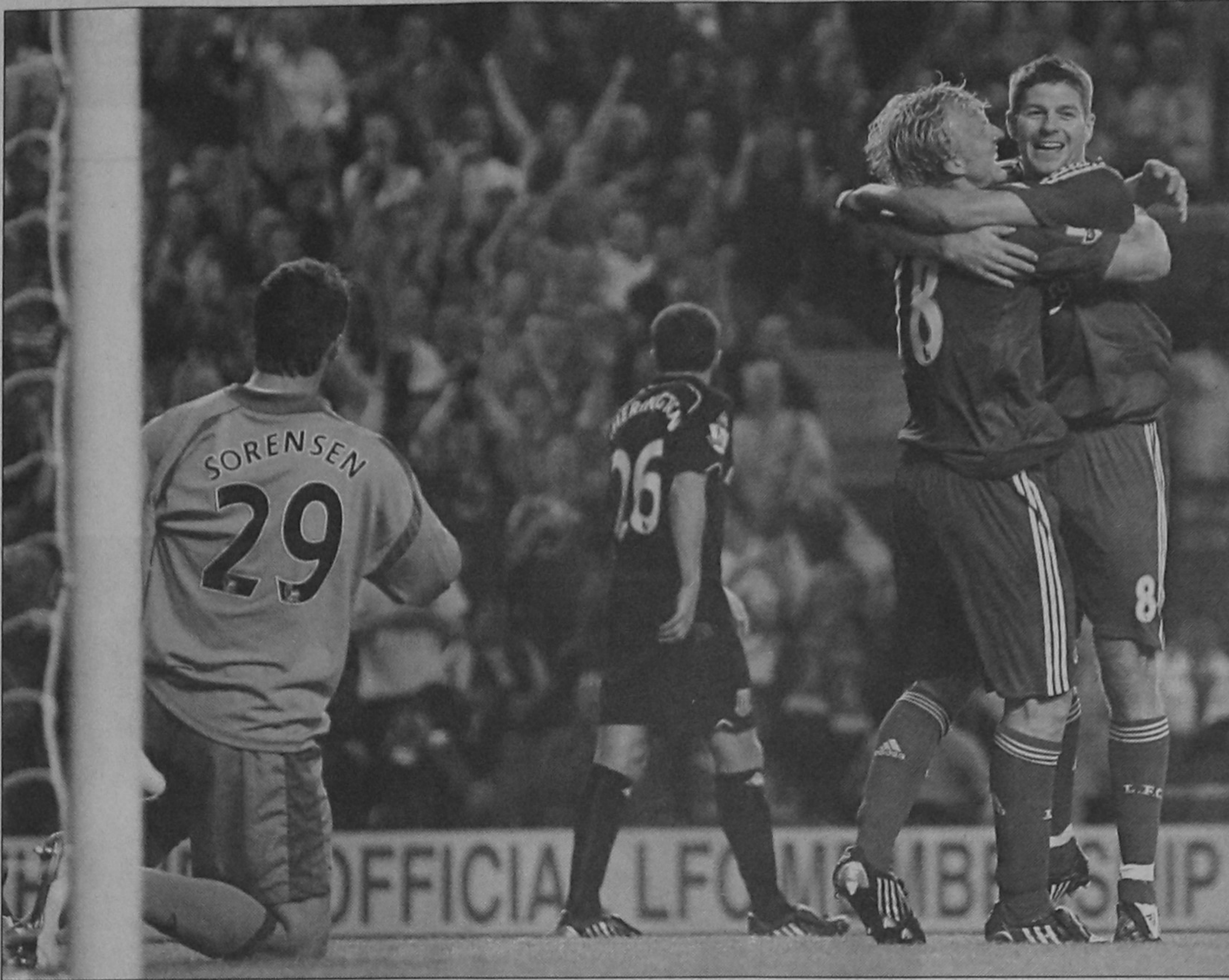
Liverpool striker Dirk Kuyt gets a congratulatory hug from teammate Steven Gerrard (R) after scoring against Stoke City during their Premier League encounter at Anfield on Wednesday. Liverpool won 4-0.

Alex McLeish's side, promoted as Championship runners-up last season, were awarded the spot-kick when Portsmouth goalkeeper David James collided with Sebastian Larsson.