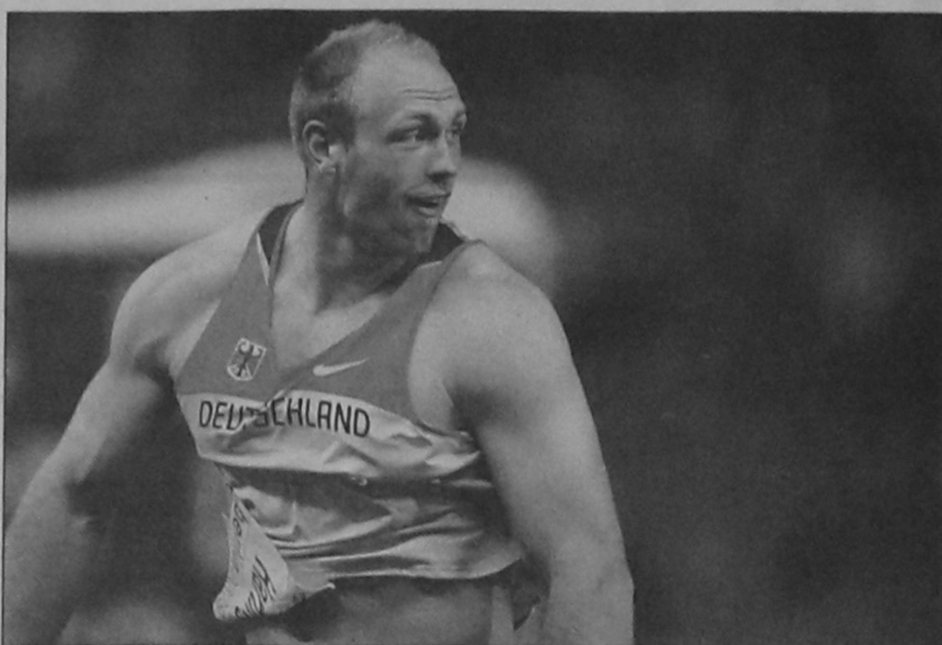
German Robert Harting looks back after a satisfying hurl in the men's discus throw that he won after close contest at Athletics World Championships in Berlin on Wednesday.

The very first Olympic race, held in 776 BC, was won by Corubus, a chef.