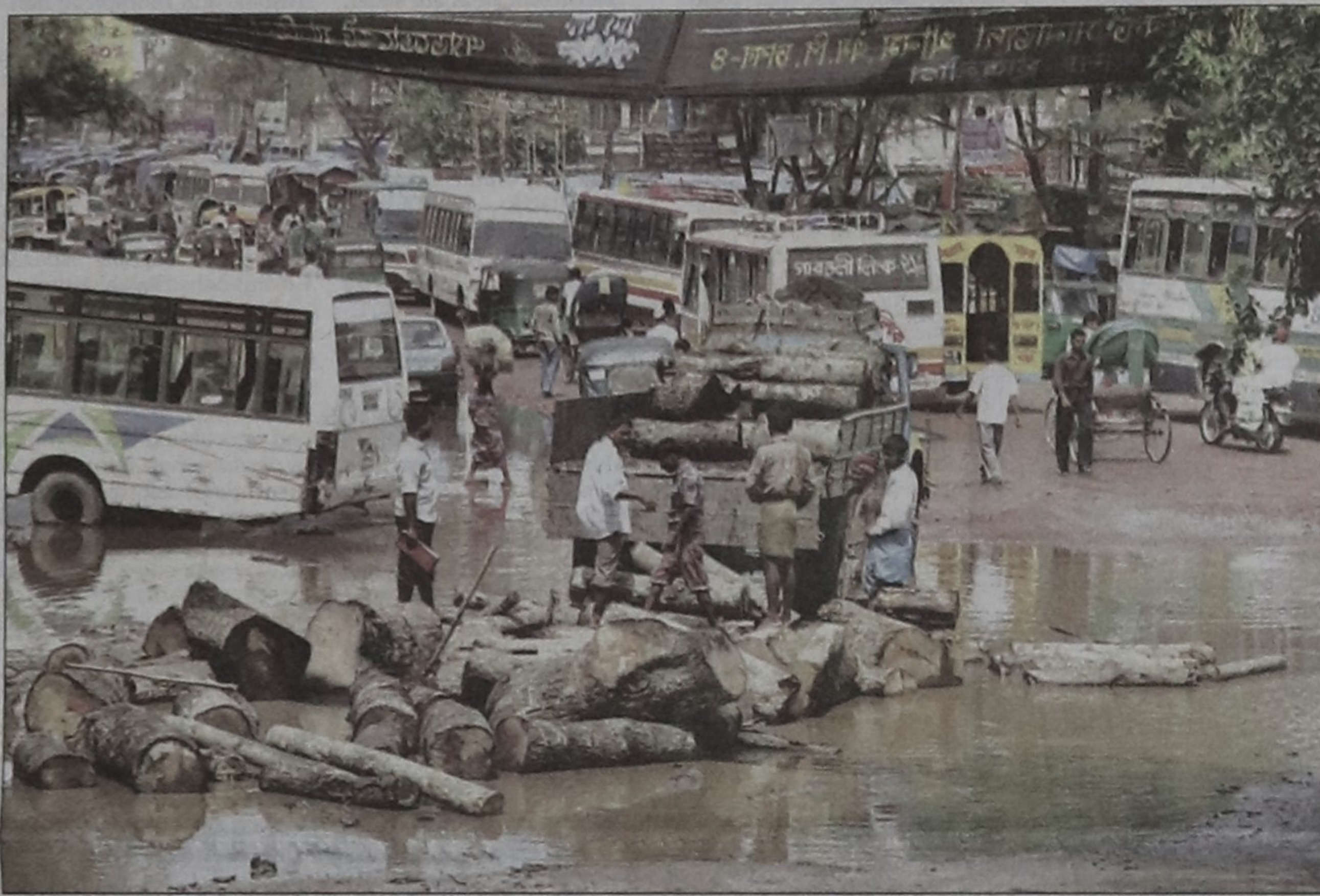
A truck loads logs on a road in Postagola in the capital yesterday after another truck loaded with these logs had tipped over falling into a deep pothole. The road has been in this state for a few months and every shower just makes it worse.