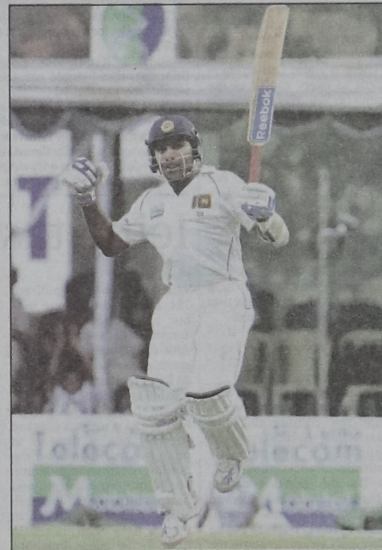
Sri Lanka batting maestro Mahela Jayawardene raises his bat after scoring a century during the first day of the opening Test match against New Zealand at Galle yesterday.