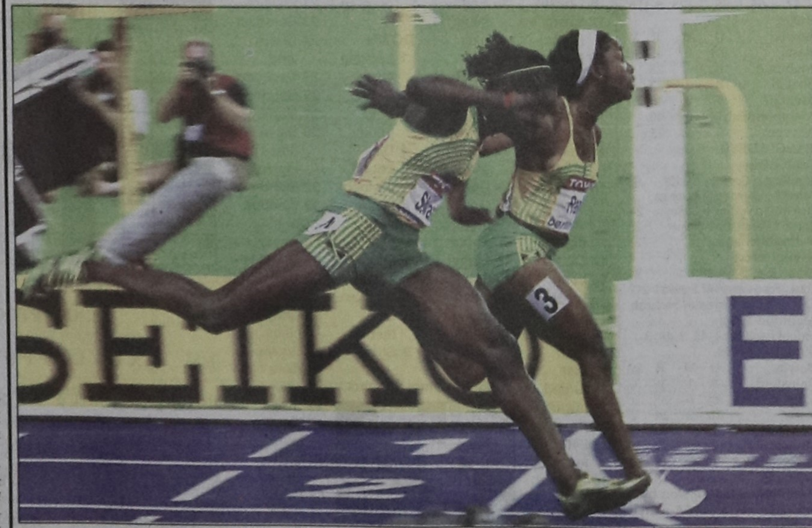
SPEED IS JAMAICA: Jamaica's Shelly-Ann Fraser (R) crosses the finish line ahead of the pack to win the women's 100m sprint at day after her fellow countryman Usain Bolt won the men's title with a new world record at the Athletics World Championships in Berlin.