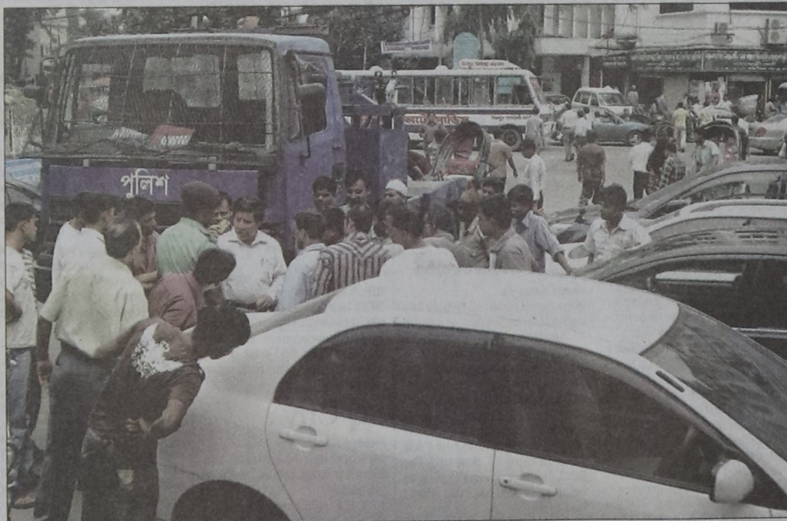
Car owners argue with the police in city's Motijheel area yesterday when a police tow truck arrived to tow away cars parked illegally on the roadside. Police failed to remove the cars, which remained parked in their places for the remaining of the day.