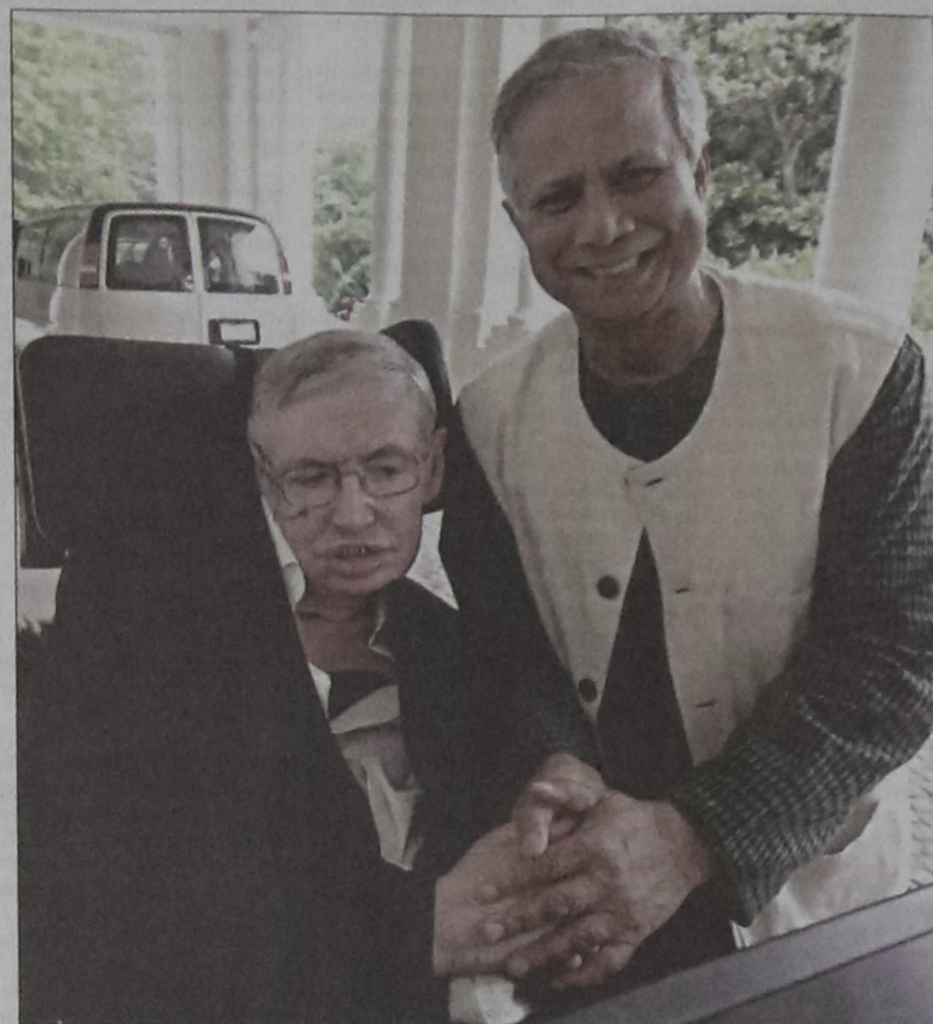
Nobel Laureate Prof Muhammad Yunus shakes hands with world-renowned physicist Stephen Hawking at White House recently. Yunus met Hawking while in the US to accept the Freedom prize from US President Barack Obama.

When asked, a trade union leader said they have been maintaining communication with the workers of the Envoy Group to resolve the dispute but local influential people are making troubles to establish control over the jhut trading.