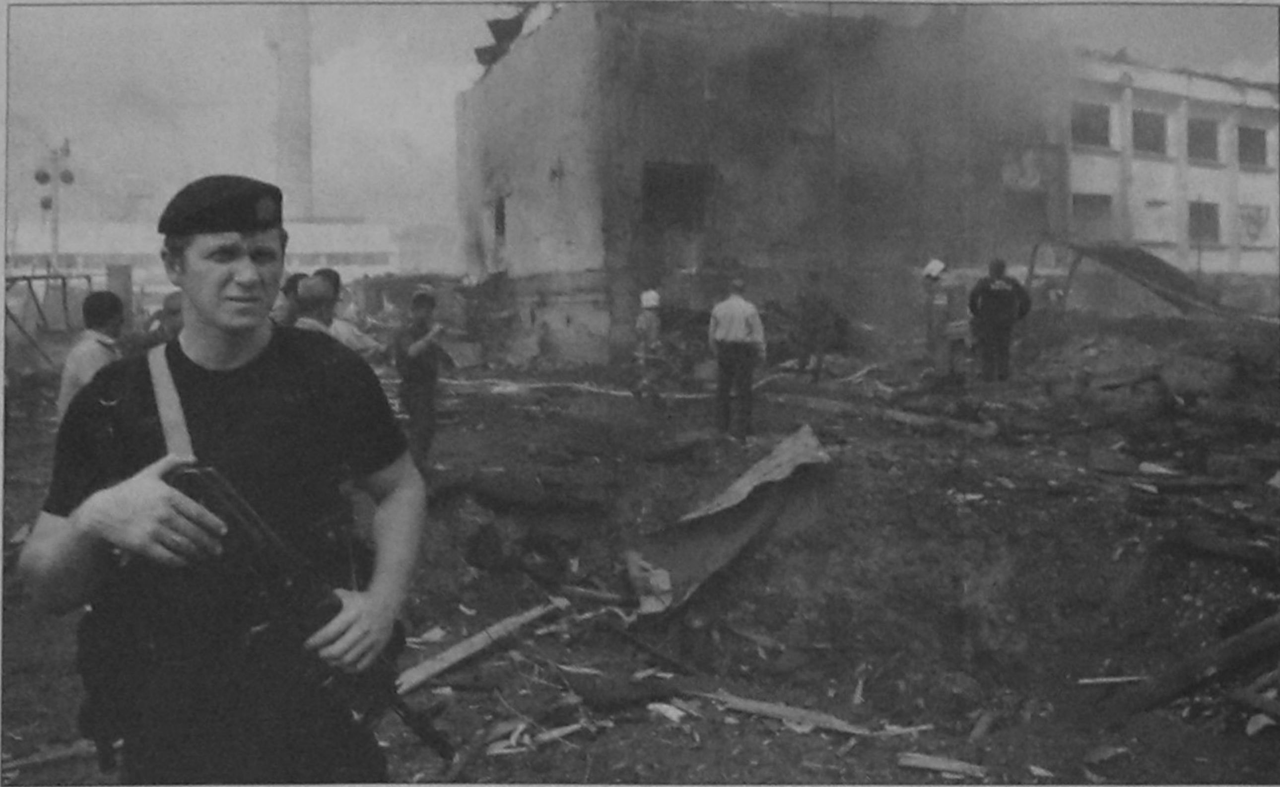
A policeman guards the site after an explosion at a police compound in Nazran yesterday. A truck packed with explosives rammed through the gates Monday of the police compound in southern Russia and exploded killing at least 20 people.