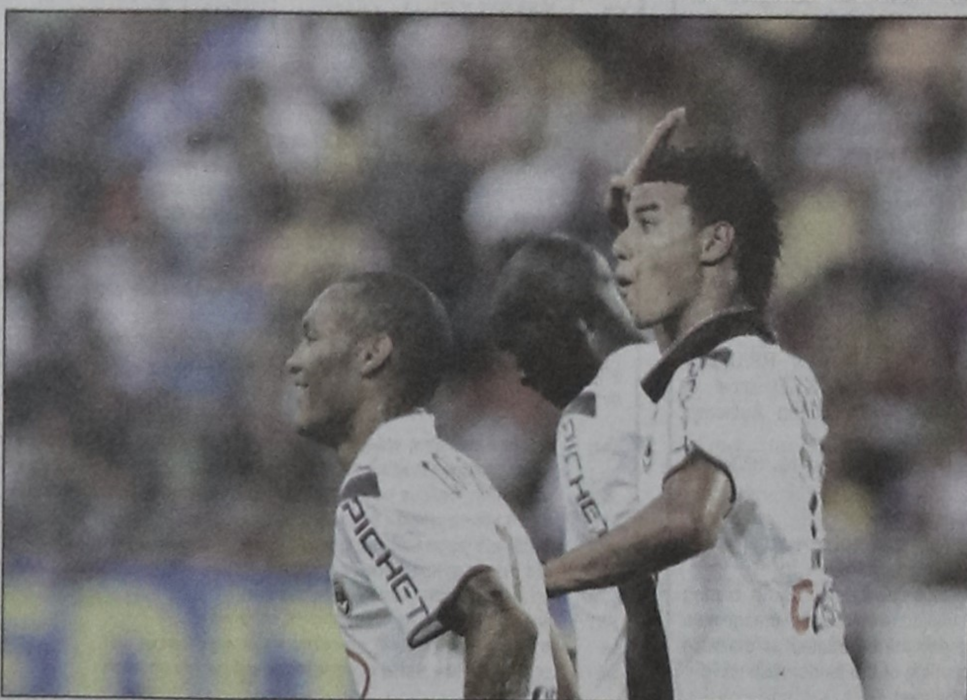
Bordeaux's Moroccan forward Marouane Chamakh (R) celebrates with teammates after scoring a goal during their Ligue 1 match against Sochaux at the Auguste Bonal stadium on Saturday.

Authorities already employ a range of measures to prevent trouble, including bans on away fans at high-risk games.