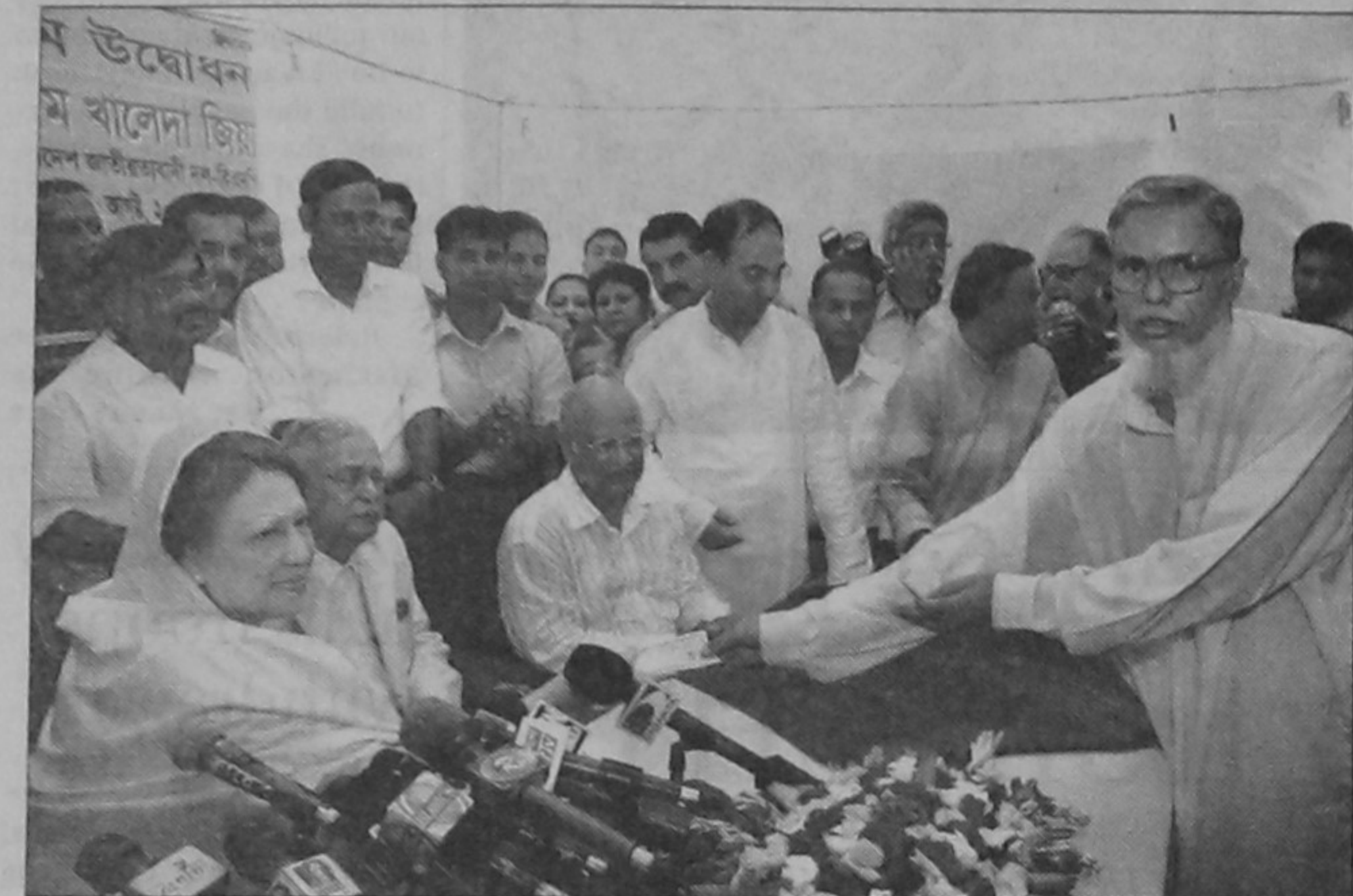
BNP Chairperson Khaleda Zia inaugurates membership collection drive at the party's central office at Naya Paltan in the city yesterday.

On this occasion, a milad mahfil will be held at her Faridpur residence at Moez Manzil, Kamapur after Asr prayers. Quarkhwani and milad mahfil have been arranged at Faridpur Muslim Mission, Kanaipur Jame Masjid and Ferdousi Begum Hafezia Madrasa and Yatimkhana at Sadarpur. Quarkhwani and milad mahfil will also be held at Miftahul Ulum Sobhania Madrasa at Zigatola in Dhaka after Asr prayers.