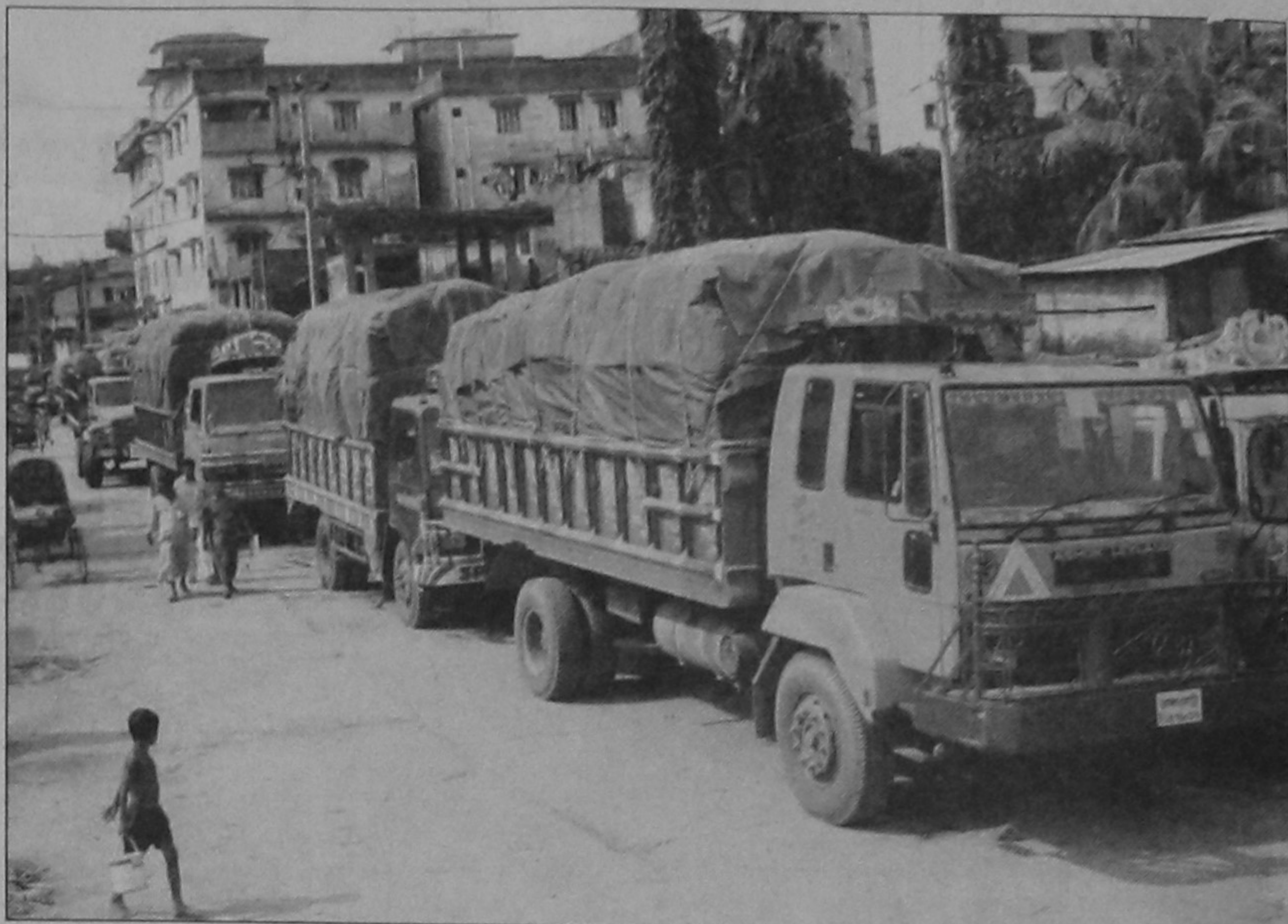
Goods-laden trucks remain stranded at Firingee Bazar due to collapse of a ferry pontoon in the port city of Chittagong yesterday.