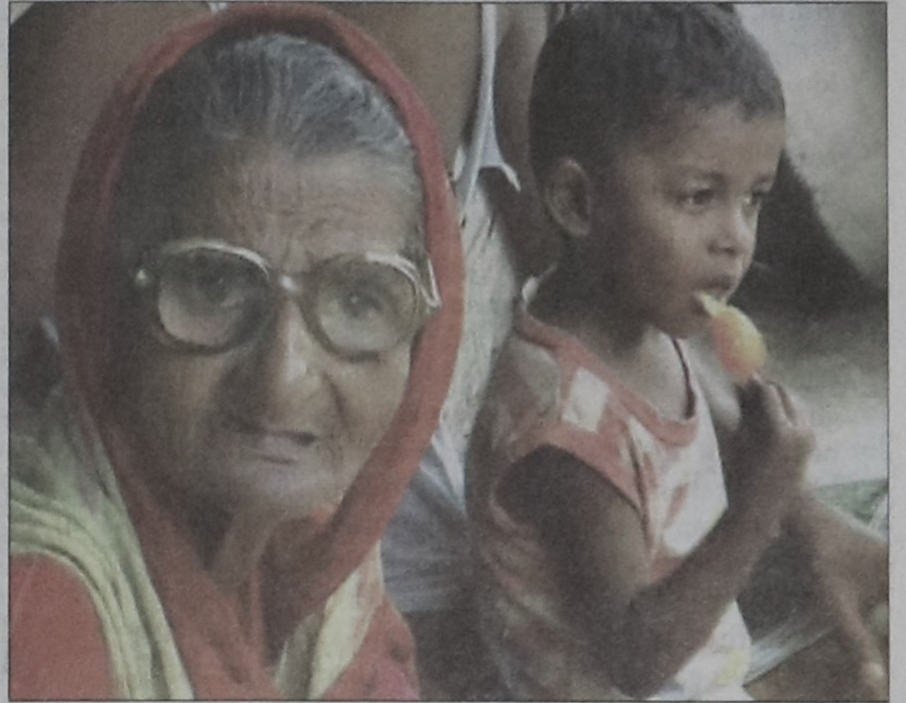
A scene from the film.

Film South Asia '09 will open on September 17 and will end on September 20 with the award-giving ceremony. The