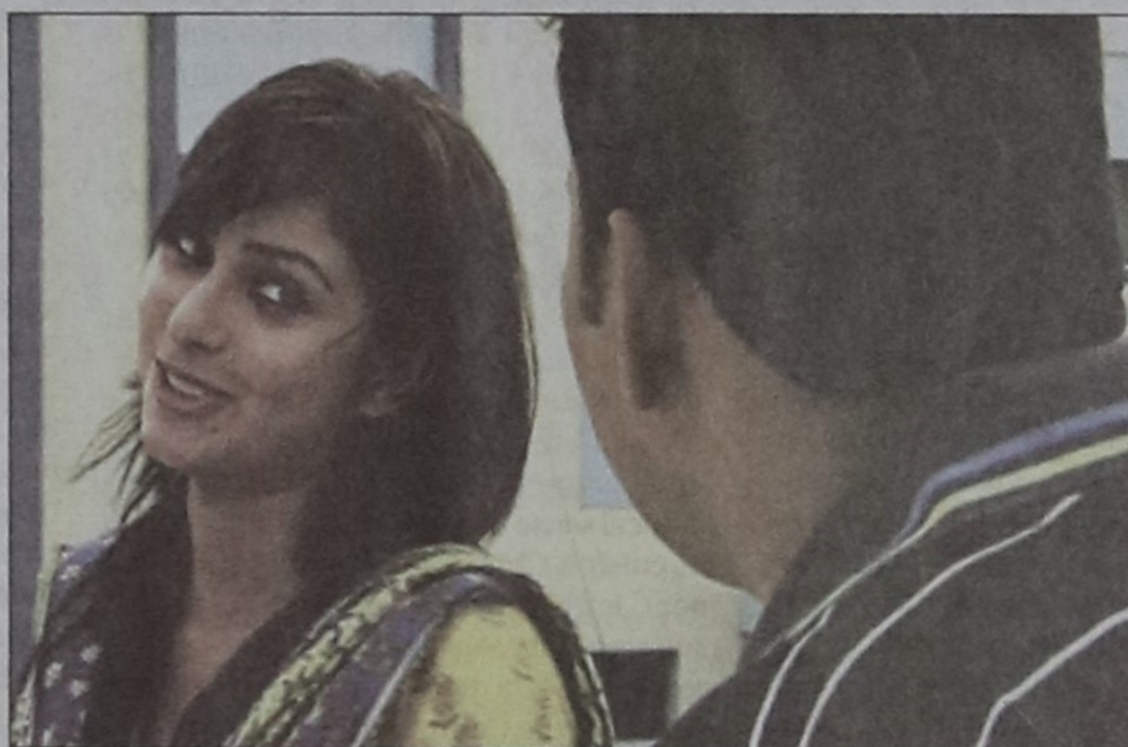
Shokh and co-actor in the TV serial.