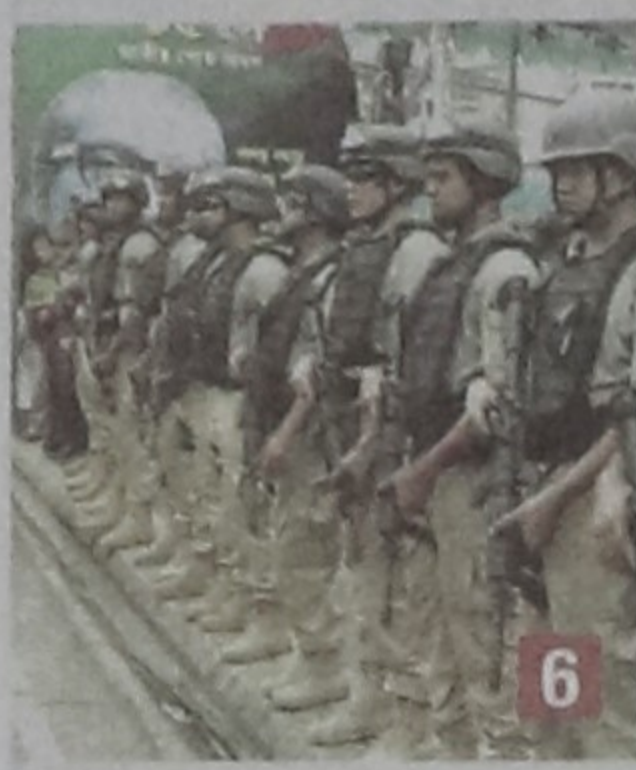
1. People from all walks of life throng Dhanmondi Road No. 32 to place wreaths at the portrait of Father of the Nation Bangabandhu Sheikh Mujibur Rahman at Bangabandhu Memorial Museum yesterday to mark the National Mourning Day. 2. Wreaths pile up in front of the portrait. 3. President Zillur Rahman and Prime Minister Sheikh Hasina offer munajat after placing wreaths. 4. Khichuri is being distributed among the destitute in front of Awami League office at Bangabandhu Avenue on the occasion. 5. Sector Commanders' Forum places a wreath at the portrait of Bangabandhu. 6. Members of elite security force stand guard near the Bangabandhu Museum area as part of beefed-up security.