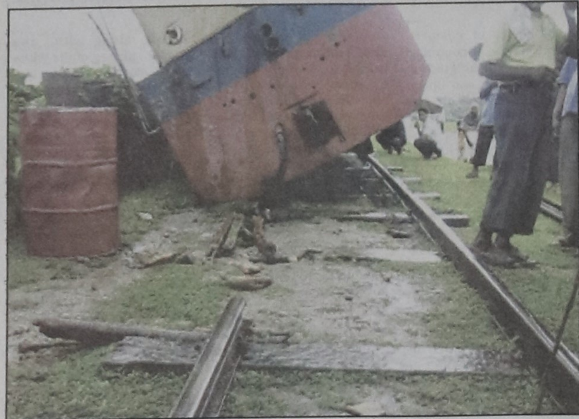
A train engine derailed at Khochabari near Lalmonirhat railway station on Lalmonirhat-Burimari route yesterday morning as criminals removed about four feet rail line.