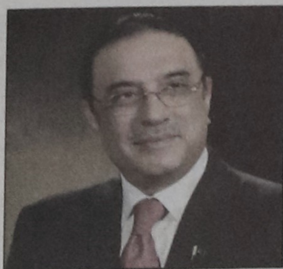
Asif Ali Zardari President of the Islamic Republic of Pakistan