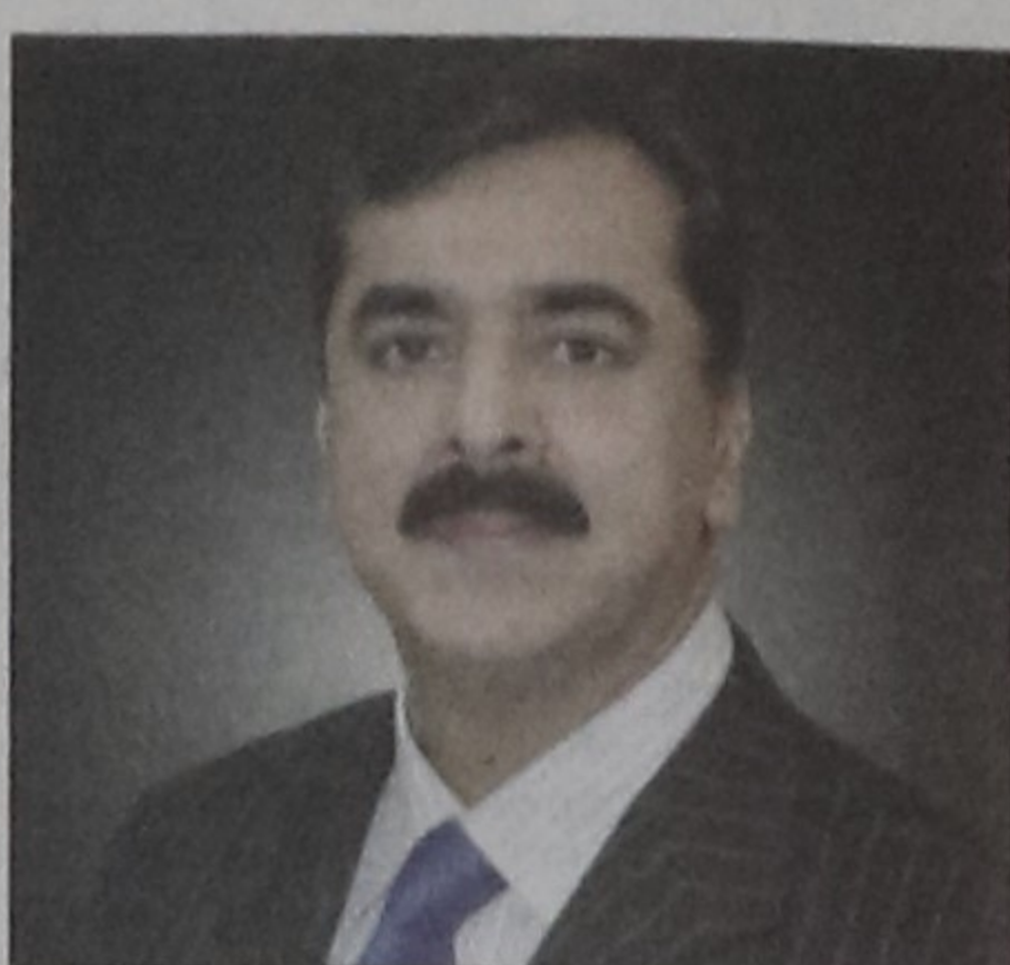
Syed Yousuf Raza Gillani Prime Minister of the Islamic Republic of Pakistan

Let us on this day rededicate ourselves to the principles of democracy and human rights, to banishing dictatorship, militancy and extremism and to provide economic opportunities for all in the country and to peace in the region.