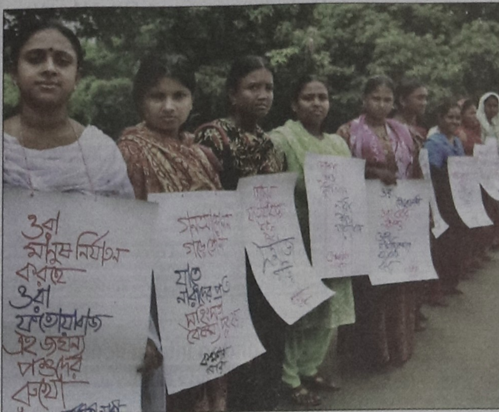
Karmojibi Nari forms a human chain at Muktangan yesterday demanding steps to punish perpetrators who are committing violence against women across the country. (Story on Page 5)