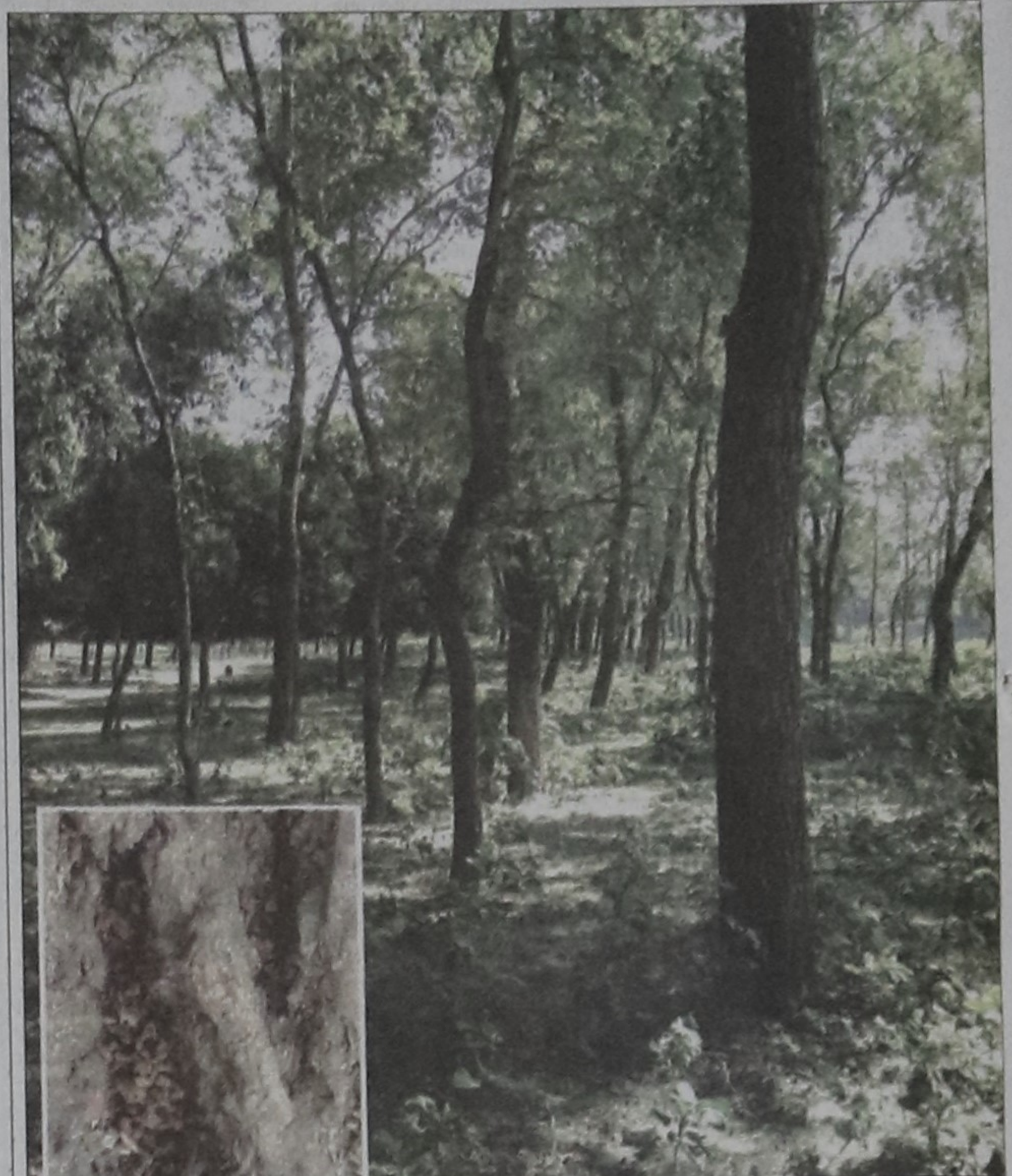
A planted Sissoo garden in Uthrail of Dinajpur, where 3,000 of the 5,000 trees have died. Inset, termites attacking a Sissoo tree soon after it had fungal infection.