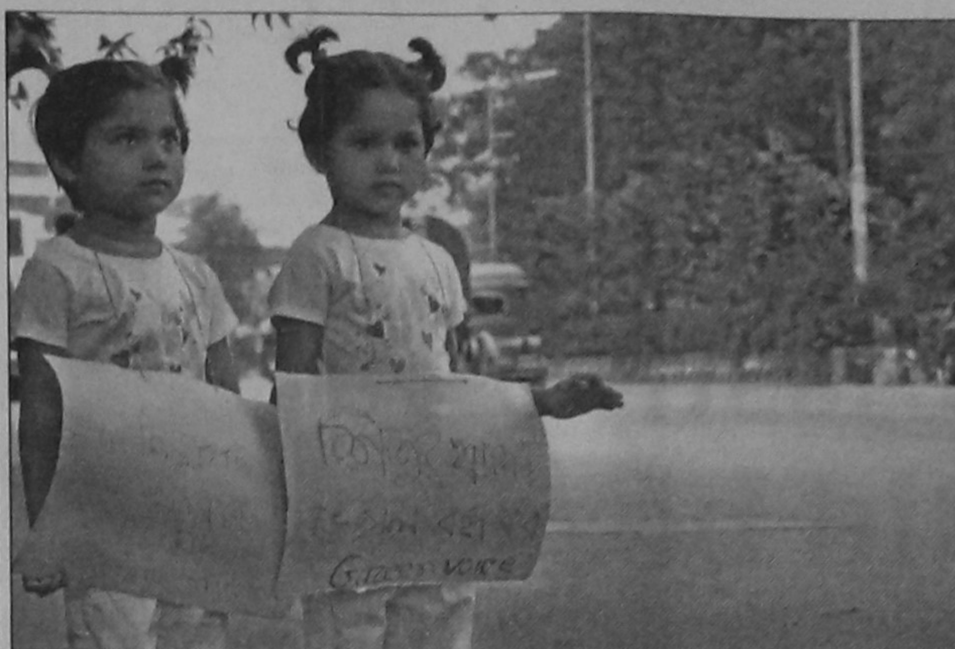
Two children hold placards with a call to stop food adulteration at a human chain programme on the Dhaka University campus yesterday. Citizens' Rights Movement and Seba jointly organised the programme.