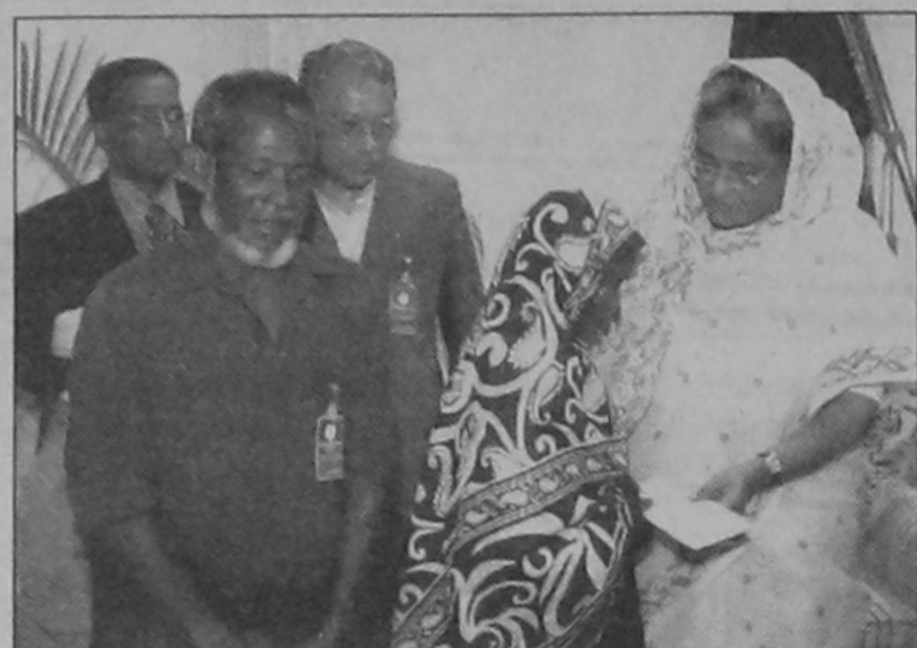
Prime Minister Sheikh Hasina hands over cheques to the family members of two slain domestic staff members of the late DG of Bangladesh Rifles (BDR) at her office in the city yesterday.