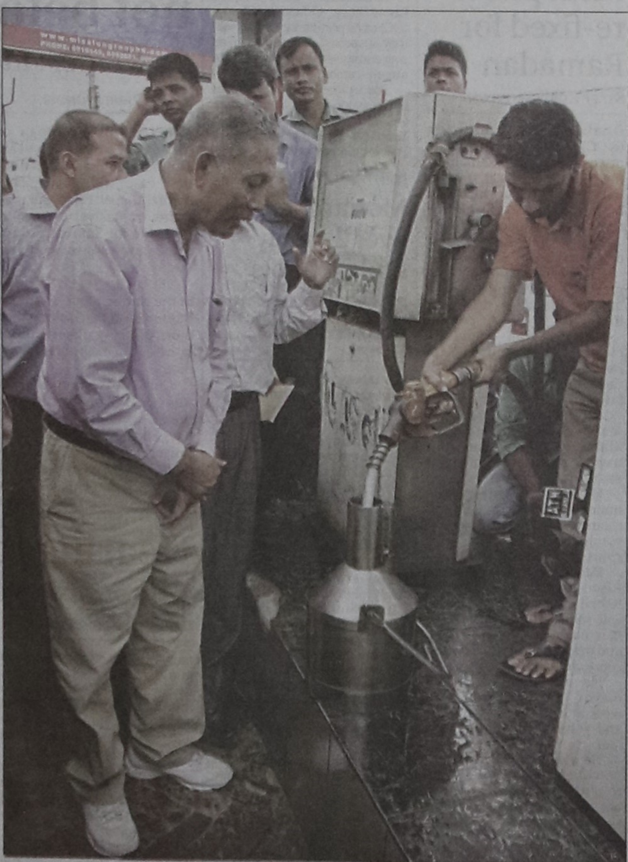
Industries Minister Dilip Barua watches as a mobile court checks filling station Amam Enterprise in Mohakhali whether it is selling motorists the correct amount of fuel. The court suspended the filling station's operation and fined it Tk 20,000.