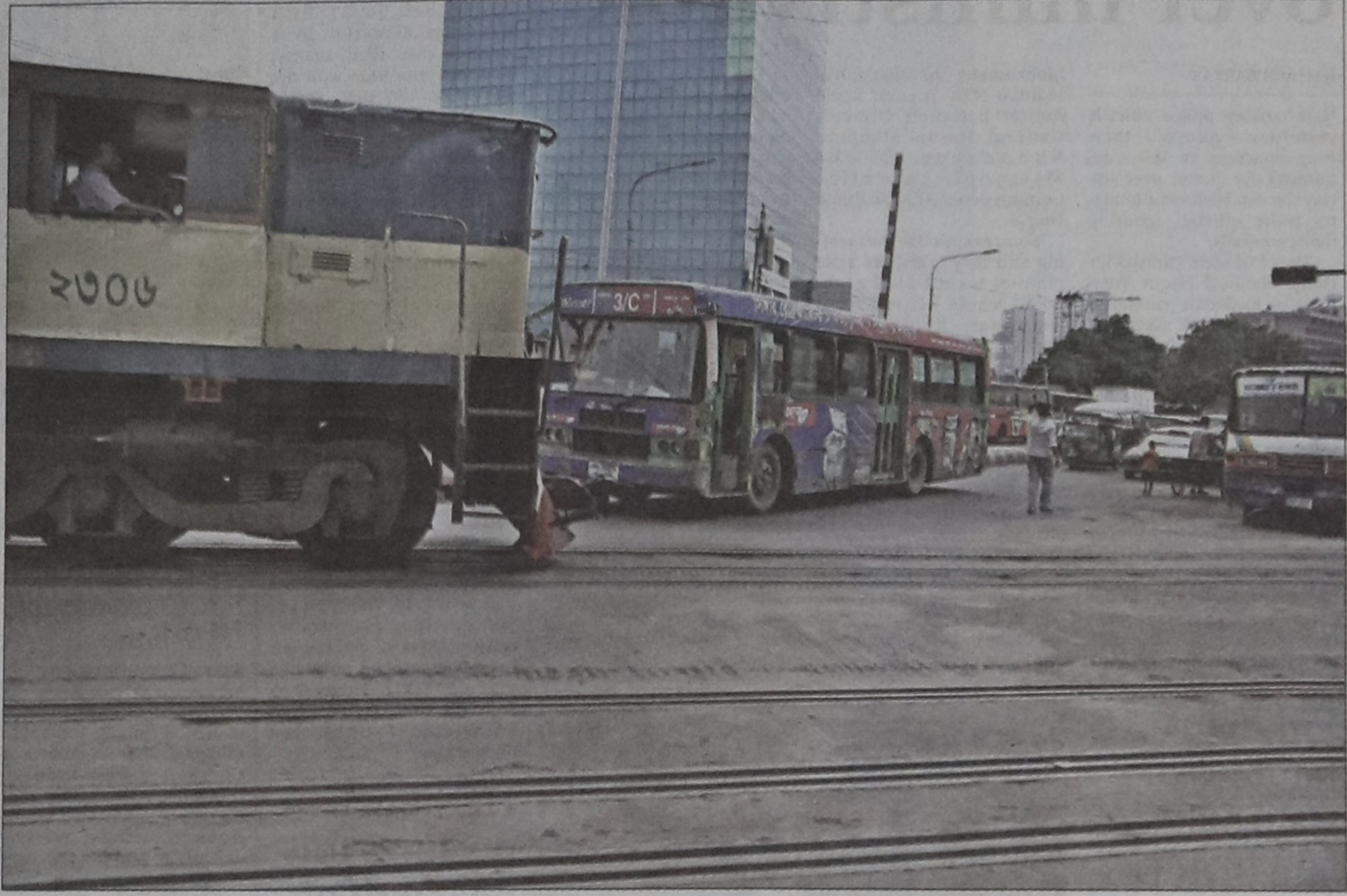
A bus halts very close to the rail lines at Karwan Bazar level crossing yesterday after it attempted to cross the lines ahead of the train. This happened only a few hundred metres away from Moghbazar level crossing where one person died when a train rammed a bus and tossed it onto other vehicles a few weeks ago.