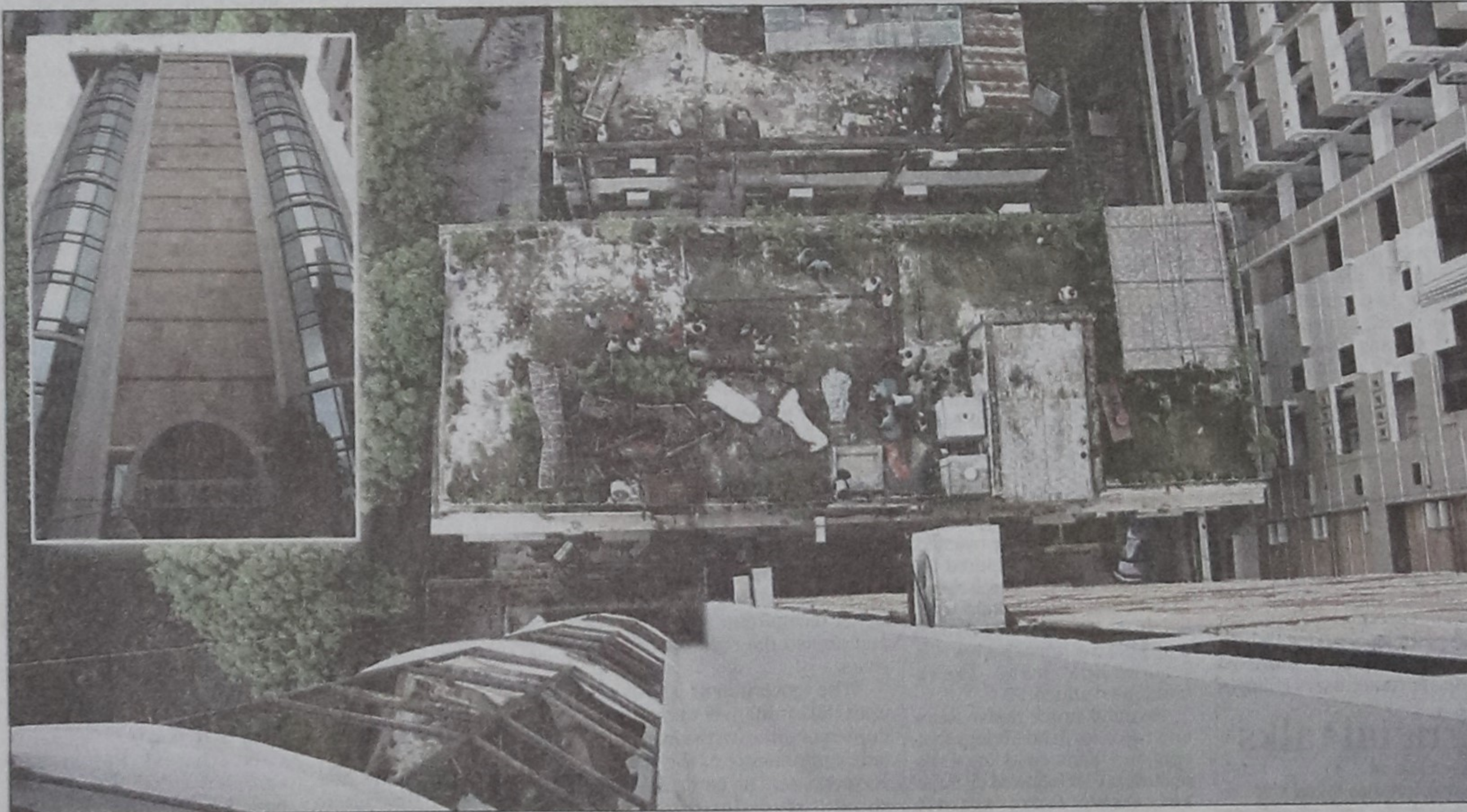
Bodies of the three workers lie on the terrace of a four-storey building next to Bell Tower in Dhanmondi yesterday. Picture inset shows the tower where the labourers were cleaning the windows when the accident occurred. (Story on page 1)