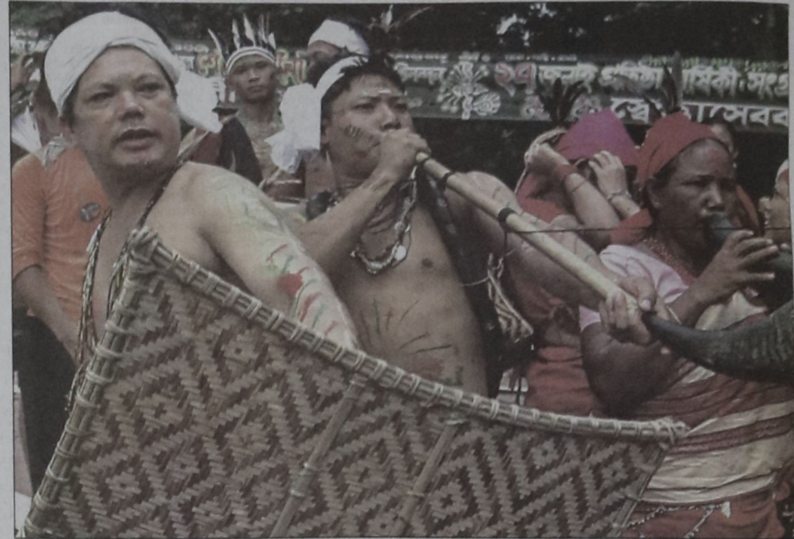
Members of the indigenous community sport traditional paraphernalia at a rally brought out from the Central Shaheed Minar in the city yesterday to mark the International Day of the World's Indigenous People.