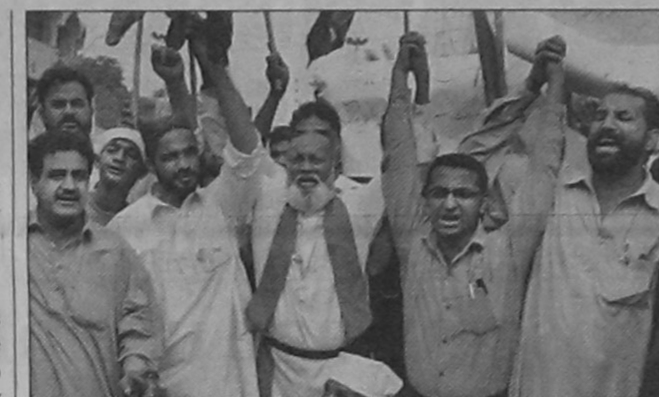
Pakistani Muslims and Christians protest during a march in Karachi on Saturday over the killing of Christians.