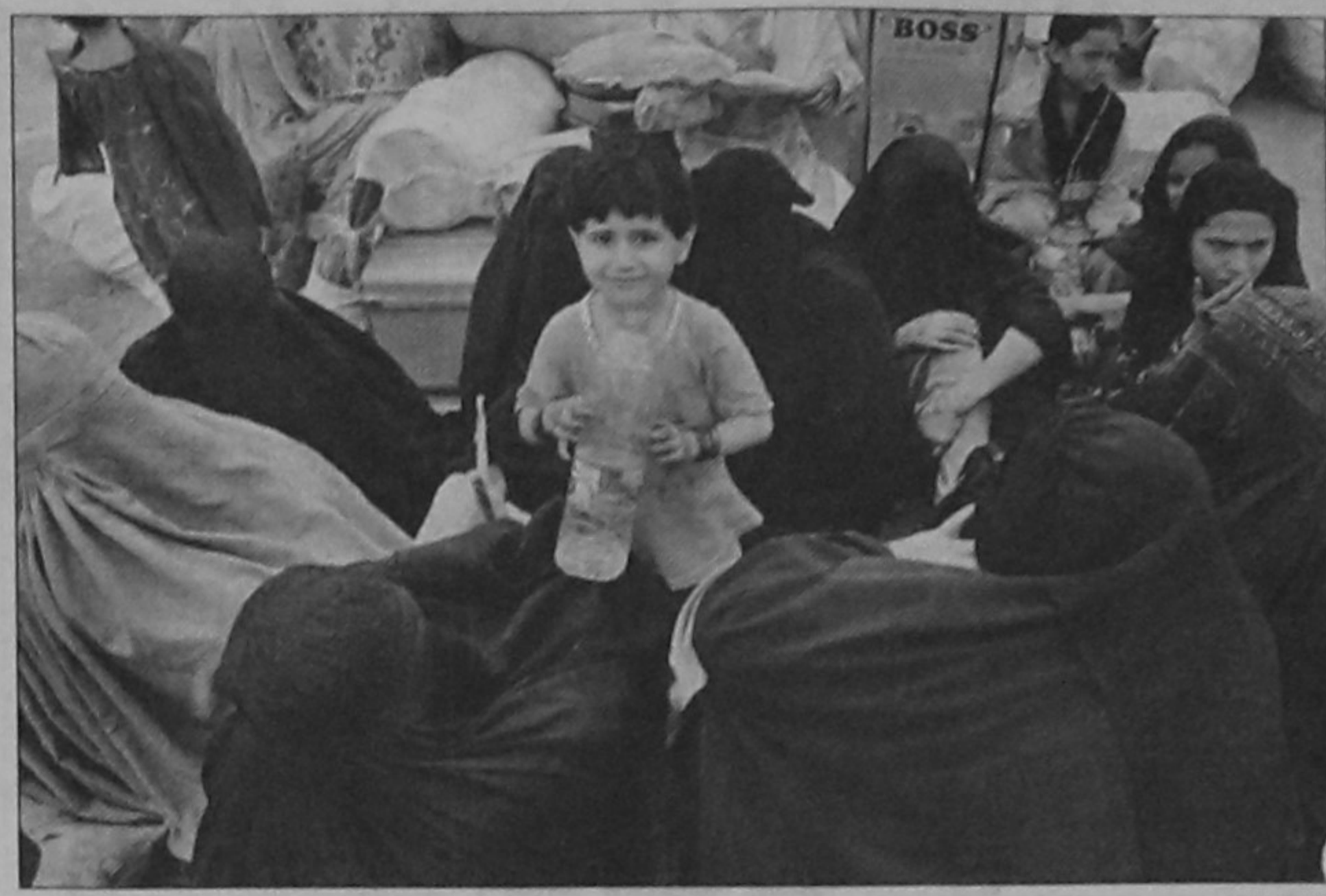
Pakistani families, displaced by the military operation against the Taliban, wait for transport to return home from a camp in Karachi on Saturday. An army spokesman claimed that nearly 100,000 families have returned to Swat.

The incidents took place in the restive northwestern town of Bannu and the tribal region of Mohmand near the Afghan border.