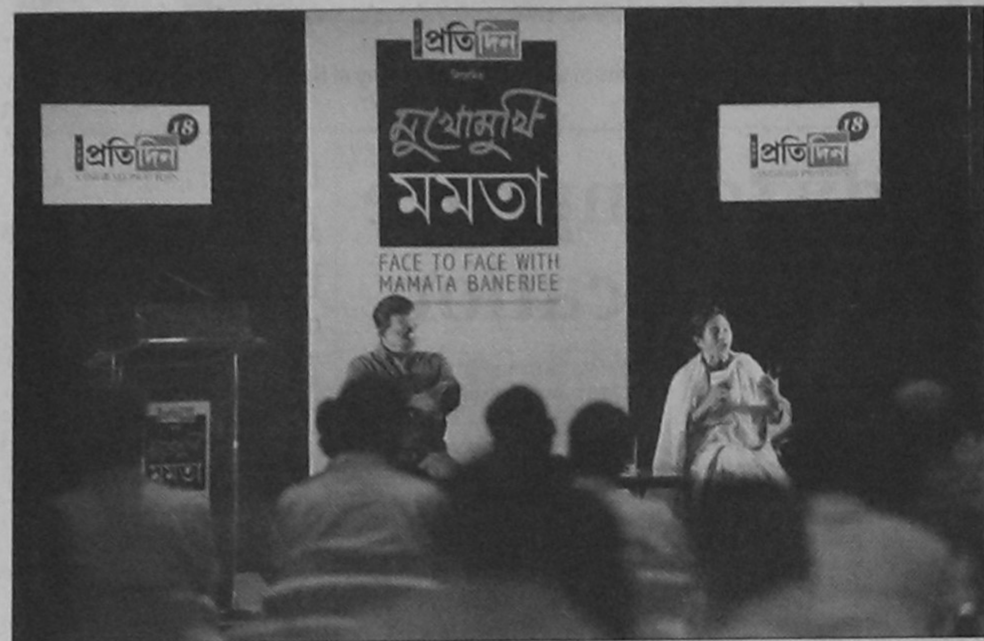
Indian Railways Minister Mamata Banerjee (R) gestures as she attends a 'face to face' interaction programme in Kolkata on Saturday. Bengali vernacular daily Sangbad Pratidin organised the programme on the 18th birth anniversary of the newspaper, attended by people of various walks of life.

The overnight fighting between rebels and tribesmen described as Salafists took place in the border area of Baqim, north of the restive Saada region, which is the rebels' main bastion, sources close to the rebels said.