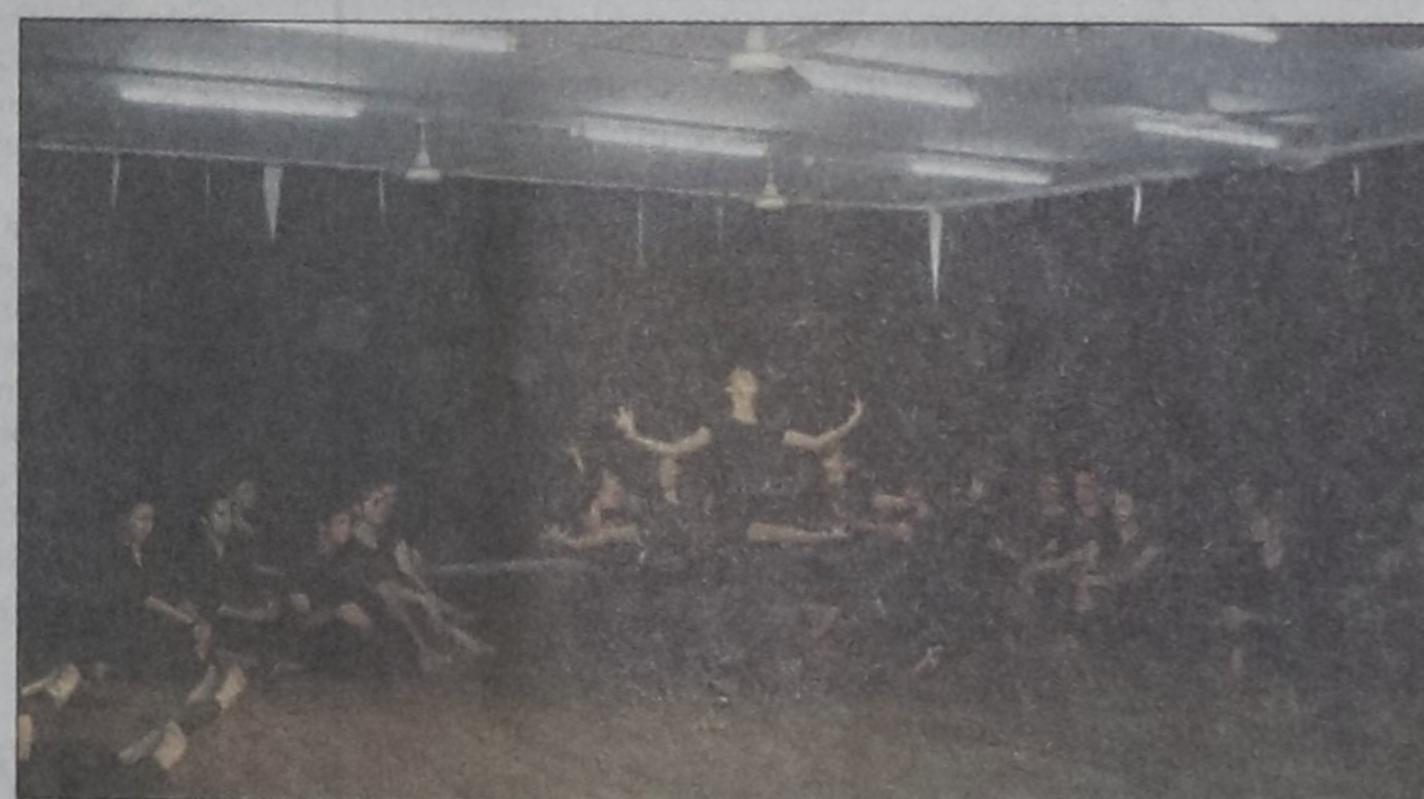
Participants of the dance workshop organised by Shadhona.

WDA, also offered two projects to the Bangladesh chapter in the winter of 2010 - a three day dance workshop to be conducted by well-known