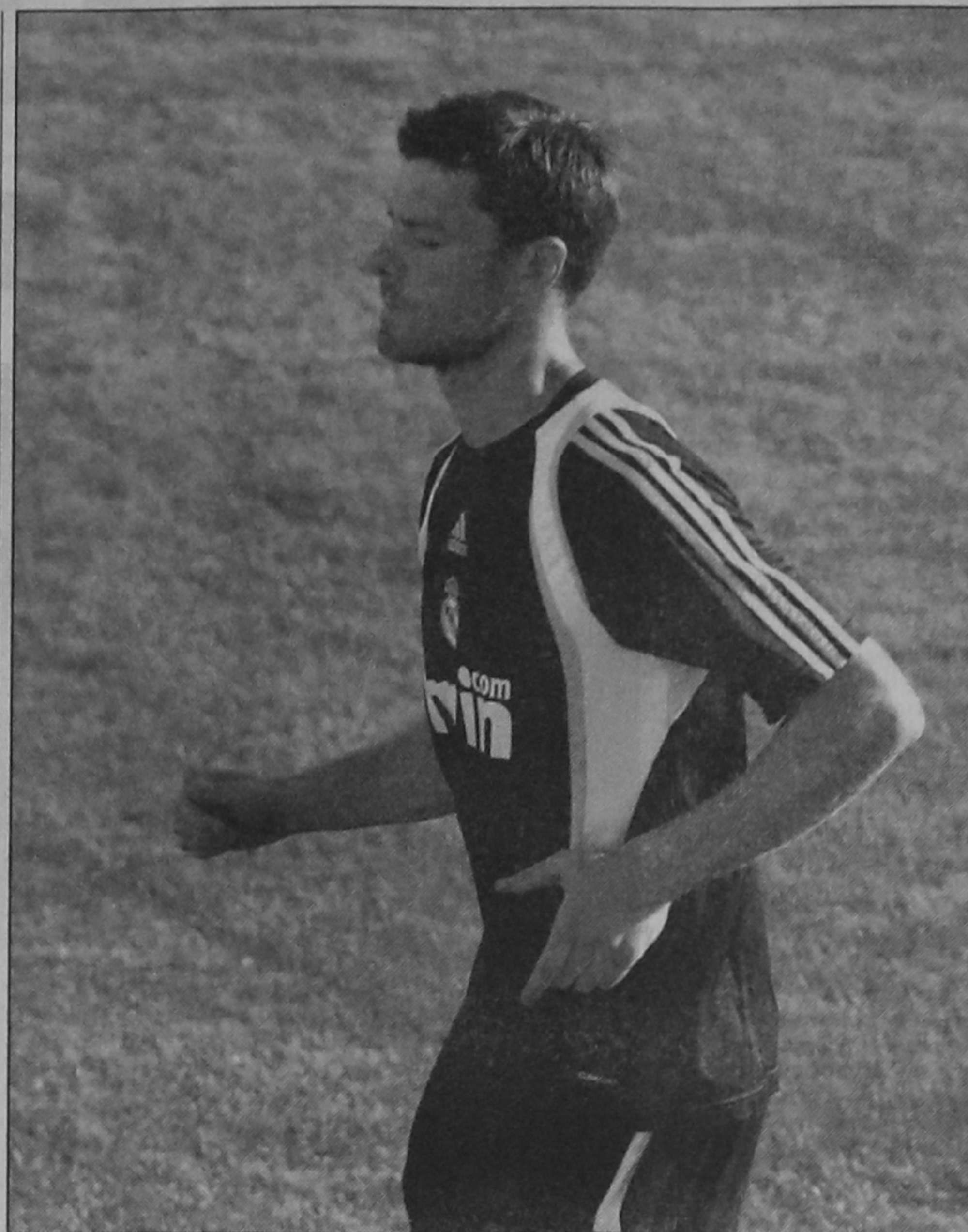
Real Madrid's new signing Xabi Alonso runs during a training session in Madrid on Wednesday.

"He probably should have had four. He showed marvellous movement at times and when he took that great pass from Wayne Rooney, he put the ball over the keeper but just past the post."