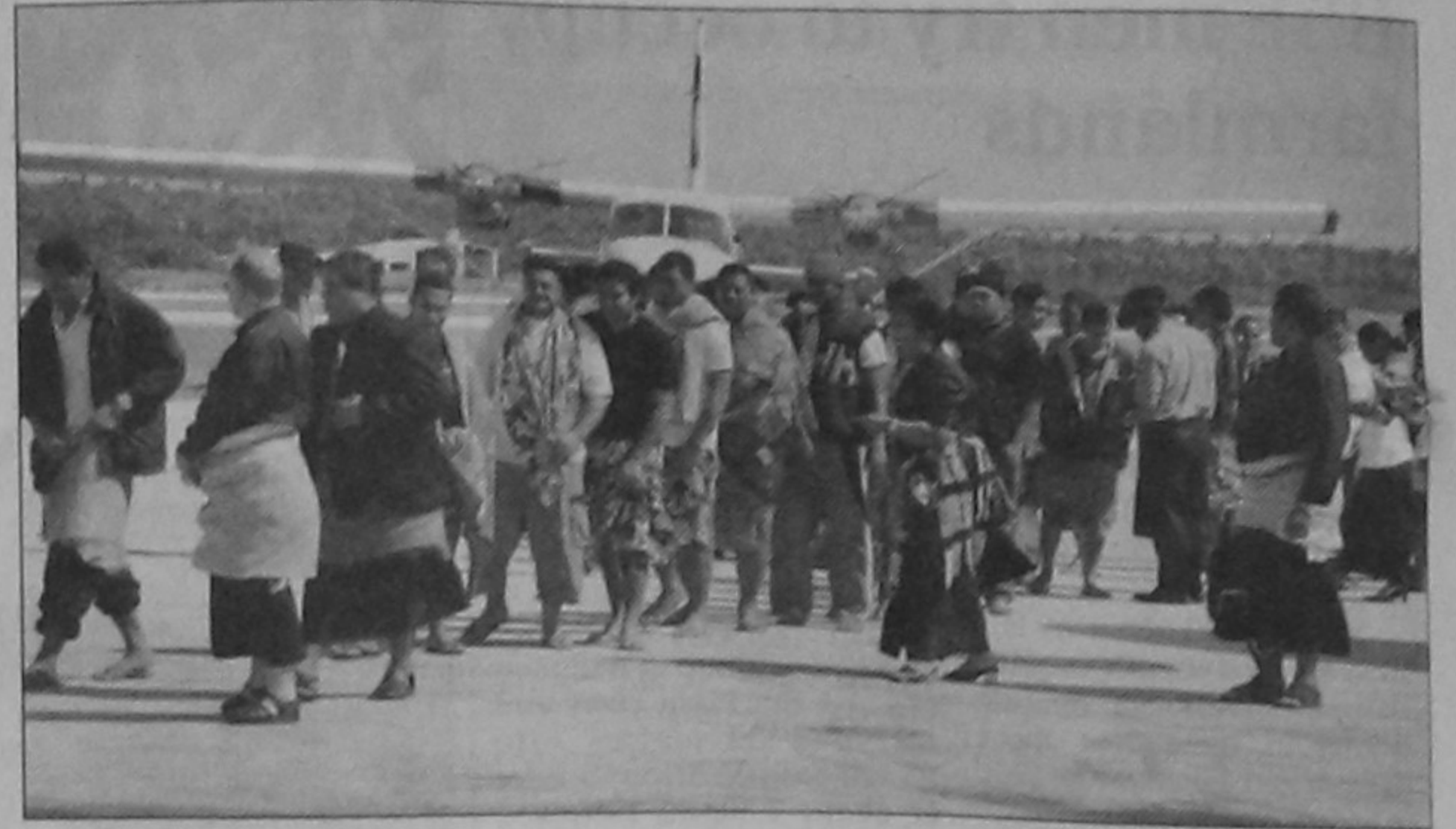
A group of male survivors arrive at Fua'amotu Airport on Tongapatu island, some 30km from Nuku'alofa yesterday after their rescue from the ferry, Princess Ashika, which sank just before midnight on August 5 while en route from the tiny Pacific nation of Tonga's capital Nuku'alofa to Ha'afeva in the Nomuka Islands group.

Ferries are an essential mode of transport in Tonga, a sprawling island nation, and elsewhere in the Pacific. A ferry sinking last month in Kiribati left 33 people dead.