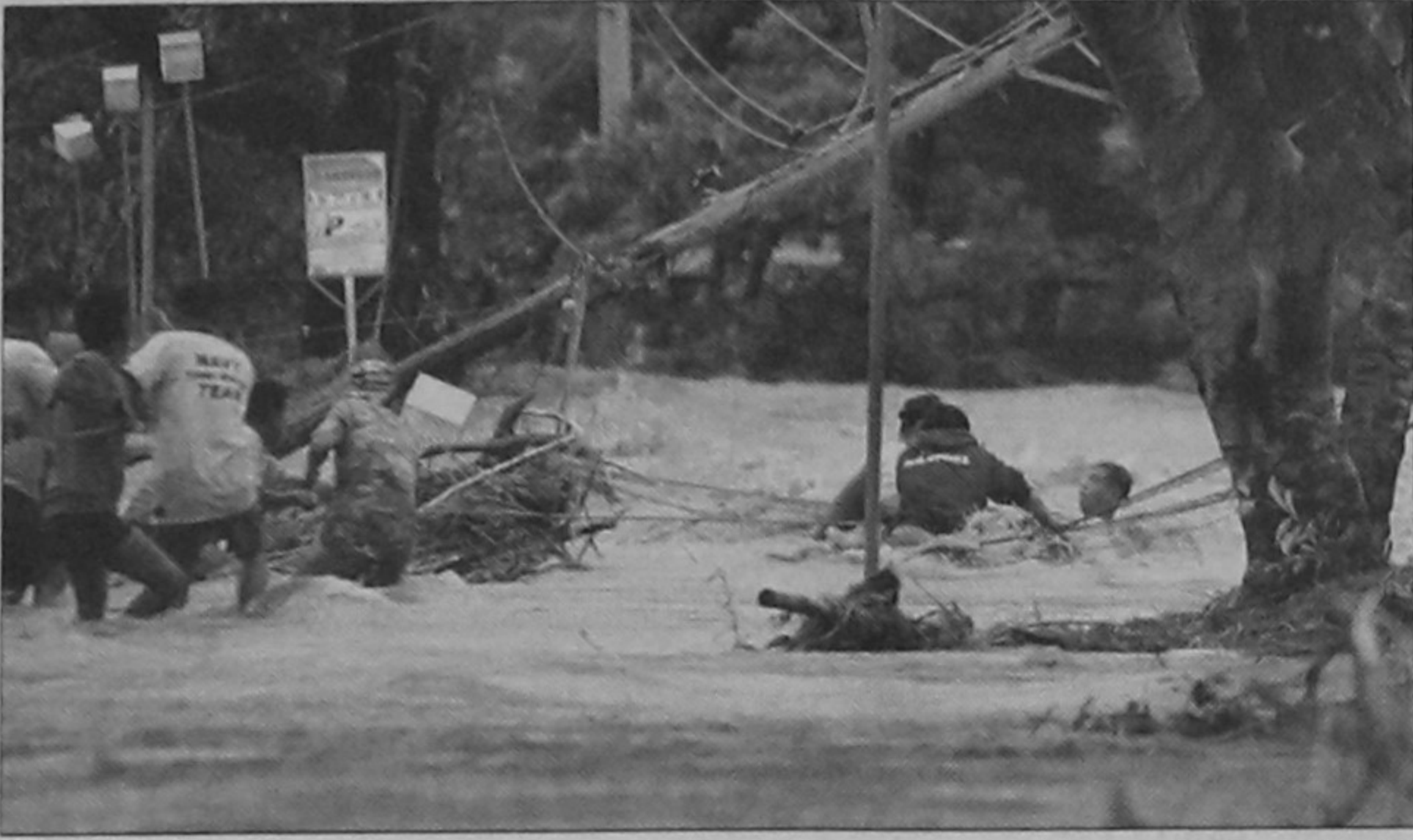
Filipino coast guard and army rescuers battle to help a resident caught in floodwaters in the Botolan district of Zambales province of the Philippines yesterday, where 10 villages have been flooded after heavy rains caused a dike to burst. Two French tourists and nine Filipinos were killed from flooding and landslides triggered by heavy rain north of the Philippine capital.