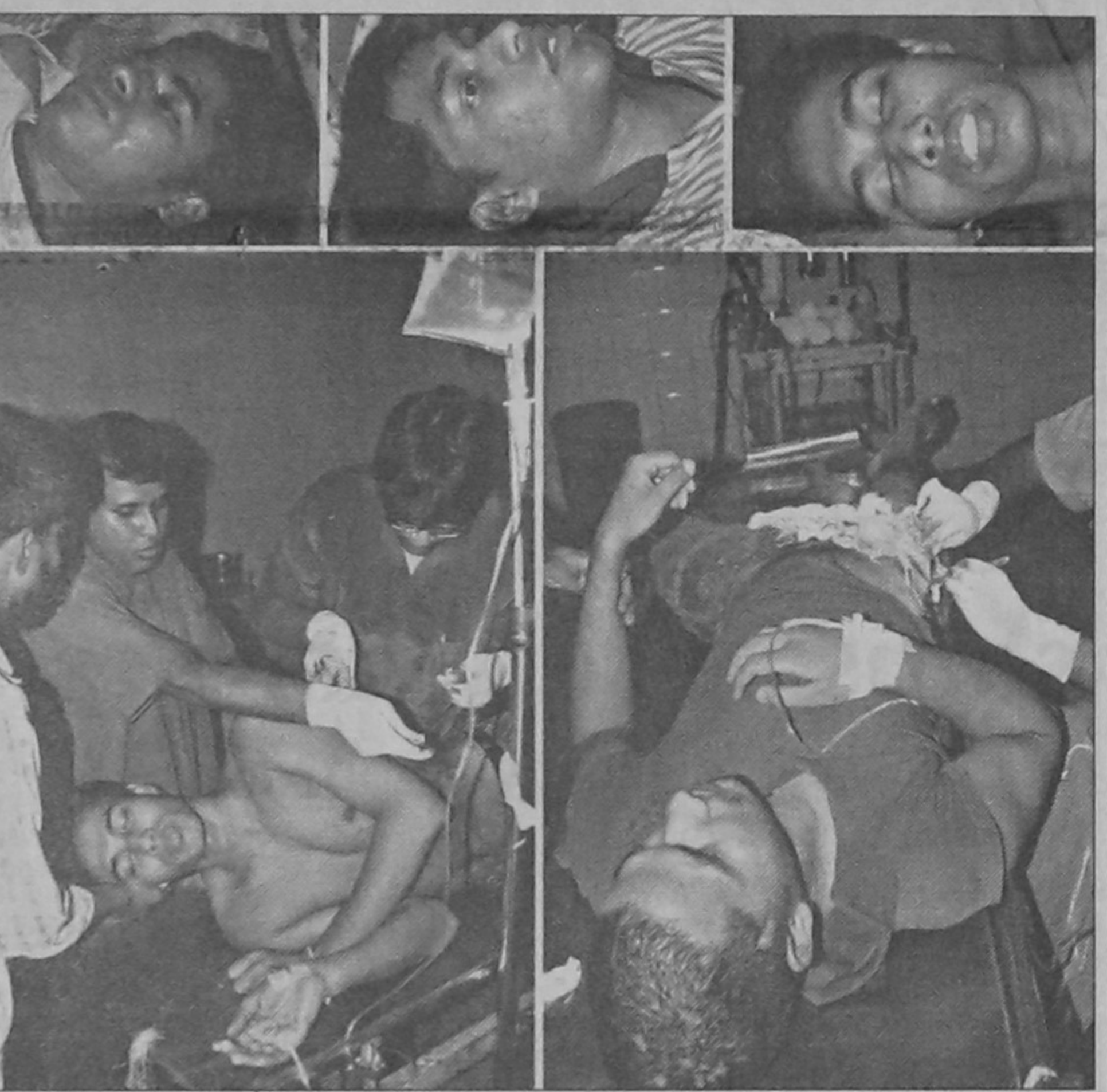
Injured students receive treatment at Dhaka Medical College Hospital. Around 12 students were injured in a factional clash of BCL at Dhaka University on Thursday. (Story on Page 1)

She left behind eight sons, two daughters and a host of relatives and well-wishers to mourn her death.