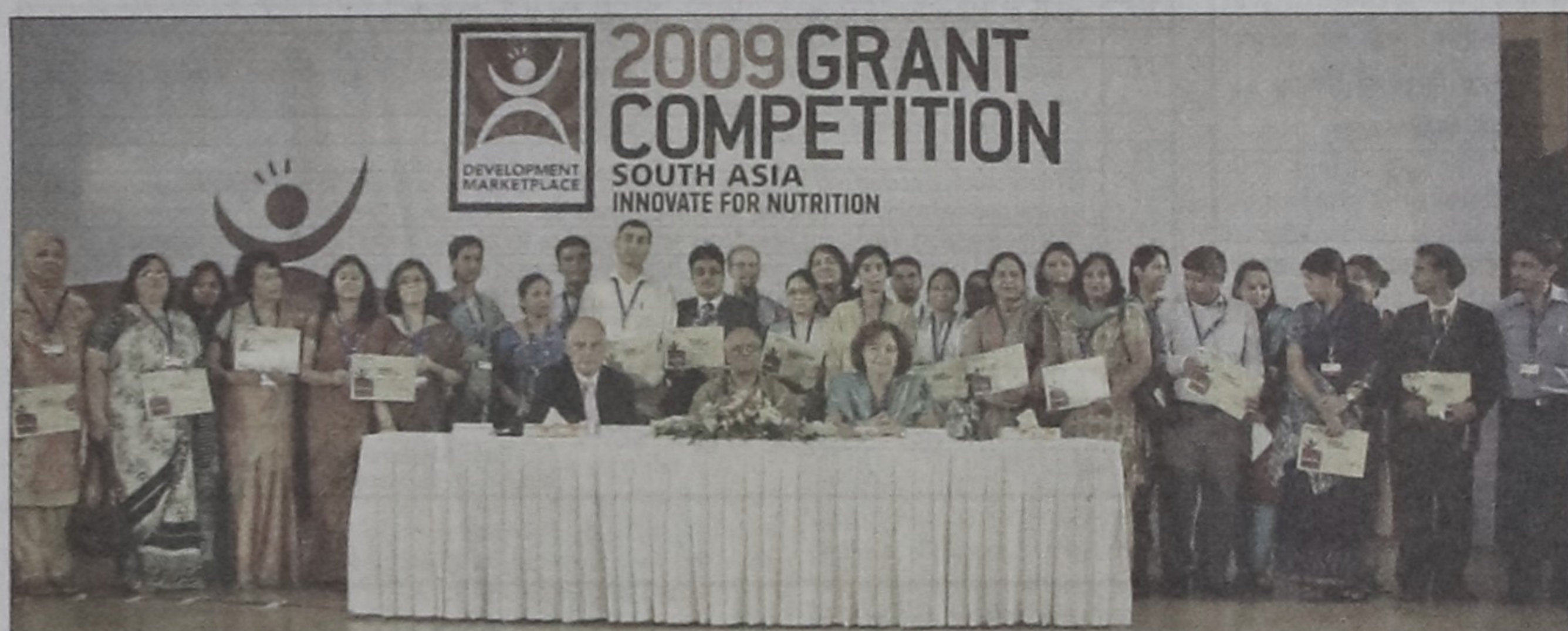
Grant recipients pose with Finance Minister AMA Muhith at a programme at Bangabandhu International Conference Centre yesterday.