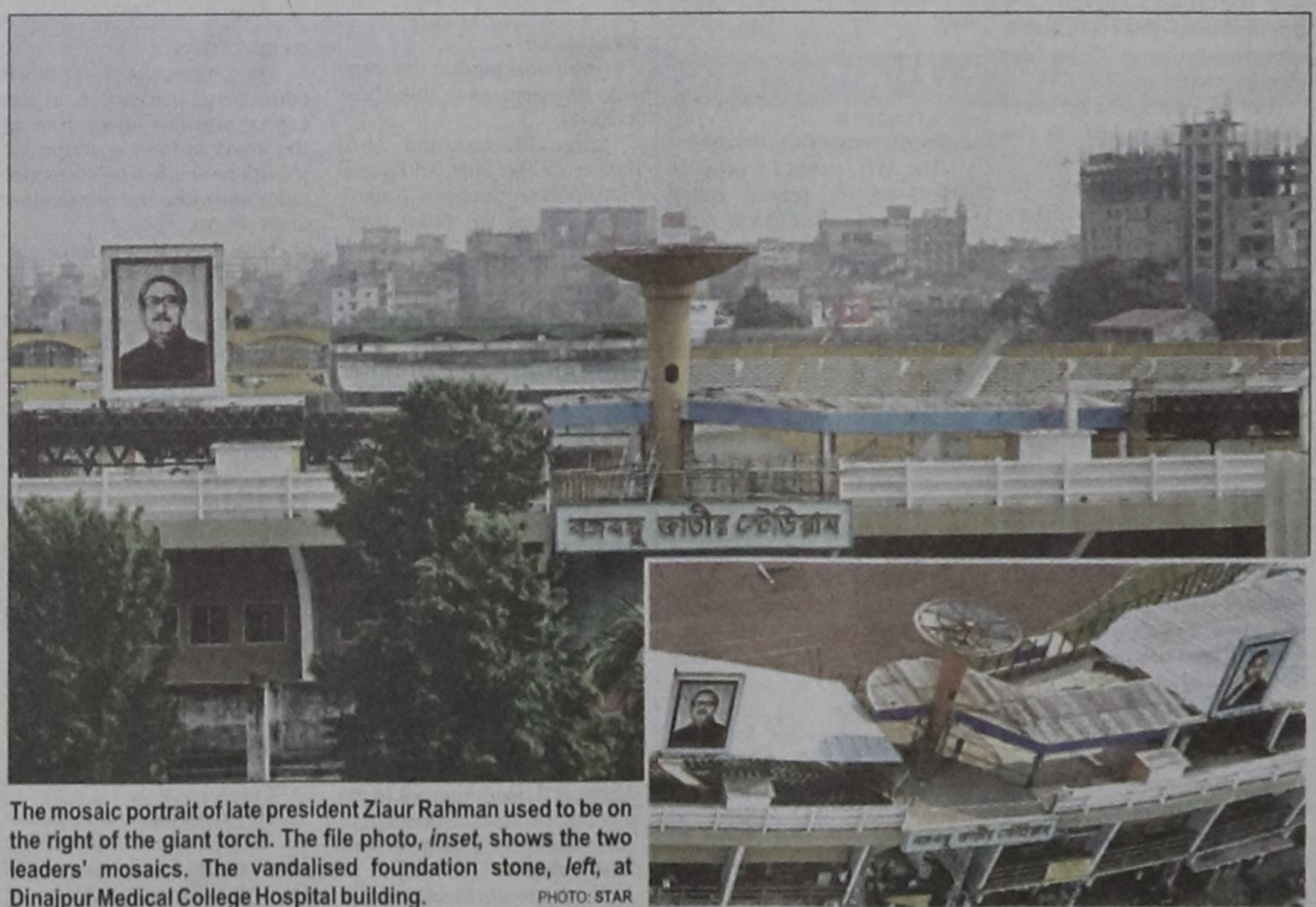
The mosaic portrait of late president Ziaur Rahman used to be on the right of the giant torch. The file photo, inset, shows the two leaders' mosaics. The vandalised foundation stone, left, at Dinajpur Medical College Hospital building.