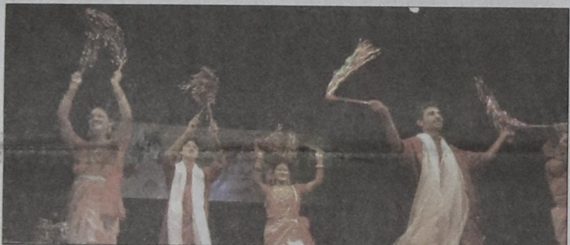
A dance performance at the programme.