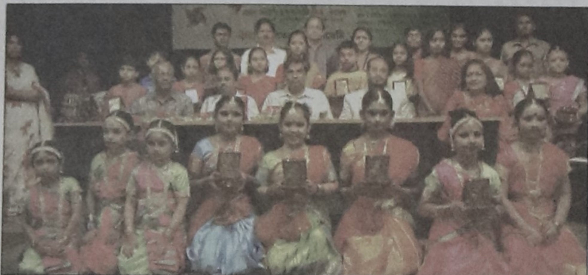
Minister of Civil Aviation G.M. Quader (seated-2-R) seen with organisers and artistes of Katha Lalitakala Academy.

At the end of the programme, students of Katha Lalitakala Academy staged a cultural programme.