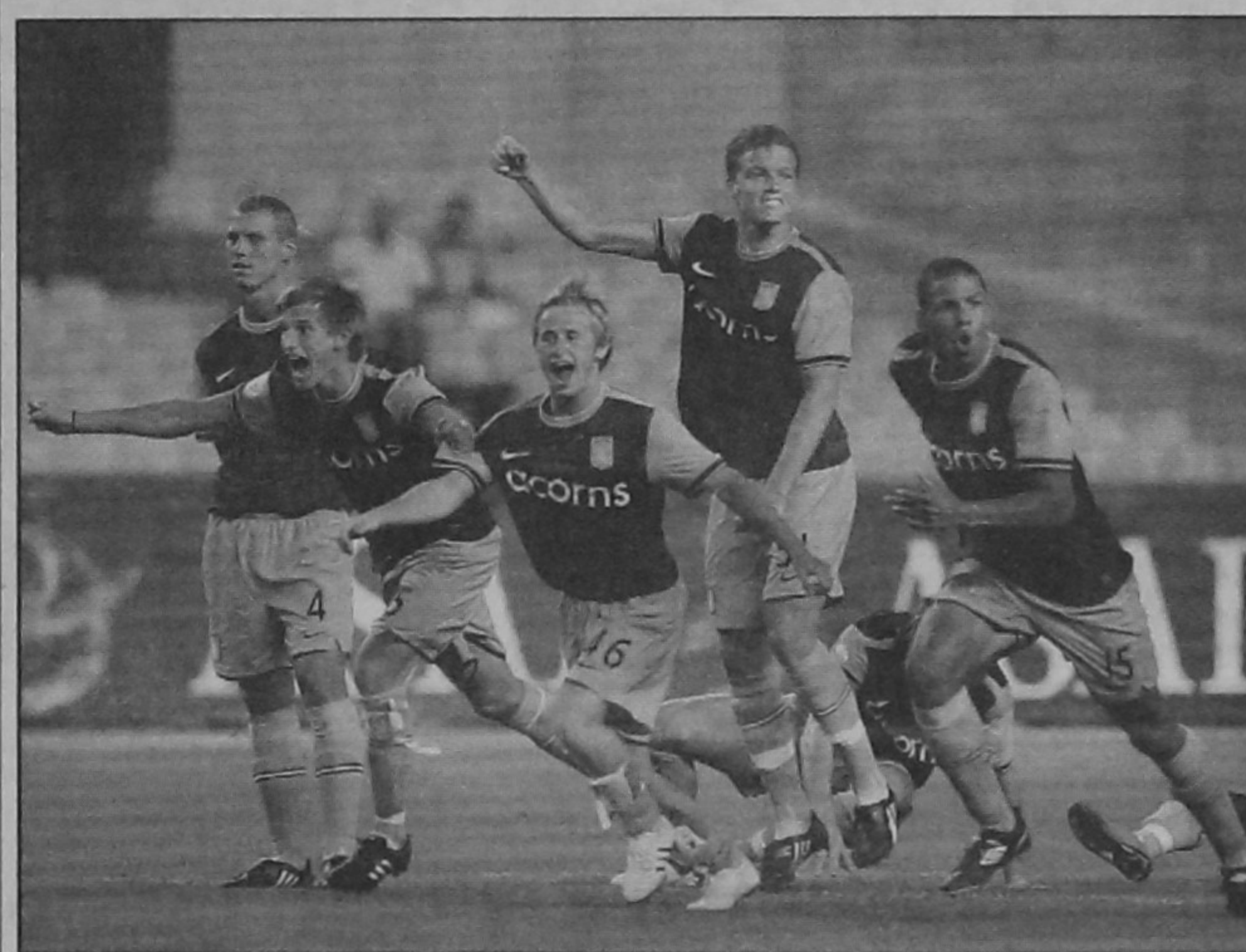
Aston Villa players are ecstatic after winning against Juventus in the tie-breaker during the Peace Cup final at the Olympic Stadium in Seville on Sunday.

This year is the first time it has been held outside of South Korea.