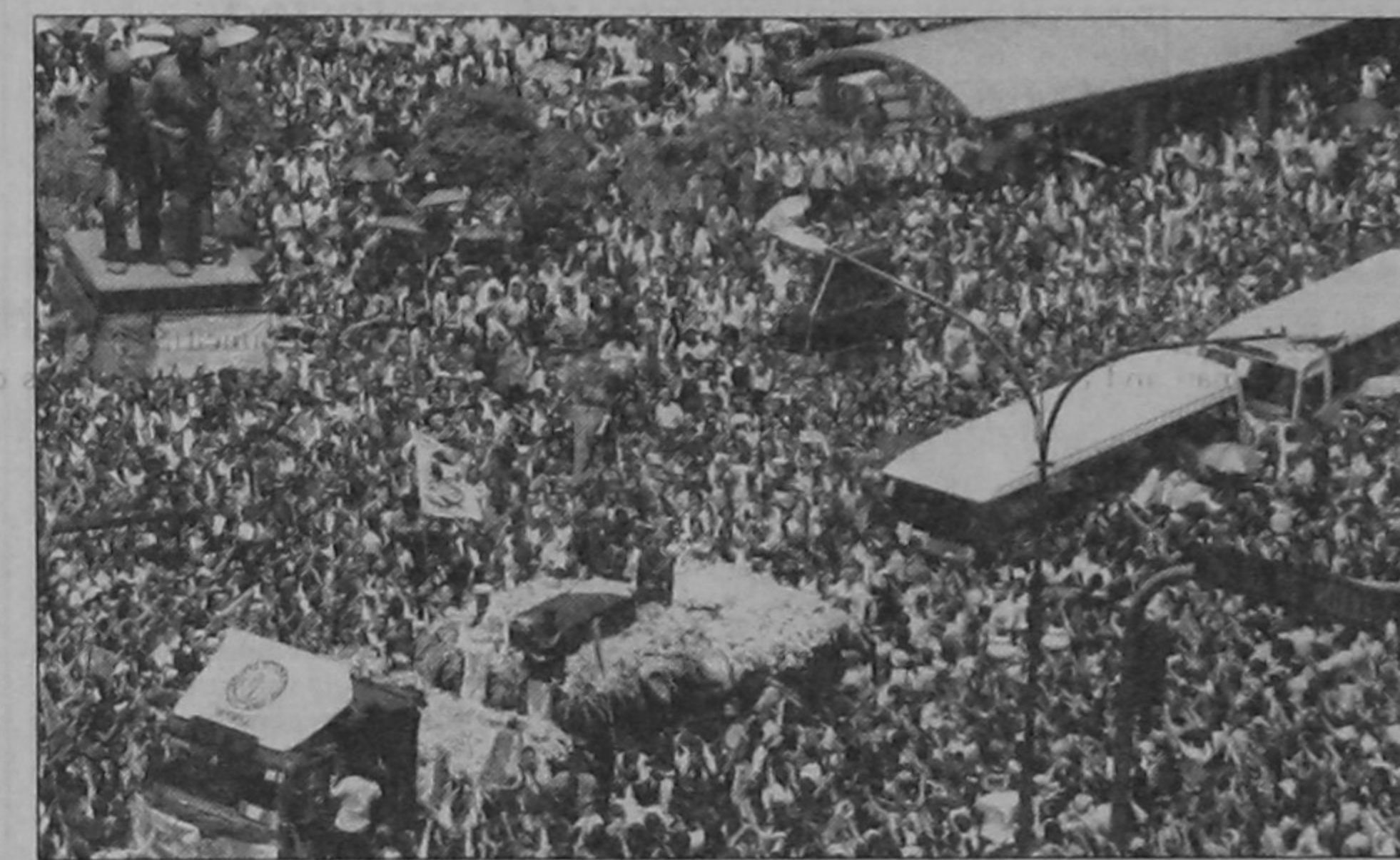
A sea of mourners crowd the cortege of former Philippine president Corazon Aquino as it passes along the main avenue of the financial district in Manila yesterday transferring her body to a cathedral.

She is to be judged under Article 152 of Sudanese law, which promises 40 lashes for anyone "who commits an indecent act which violates public morality or wears indecent clothing."