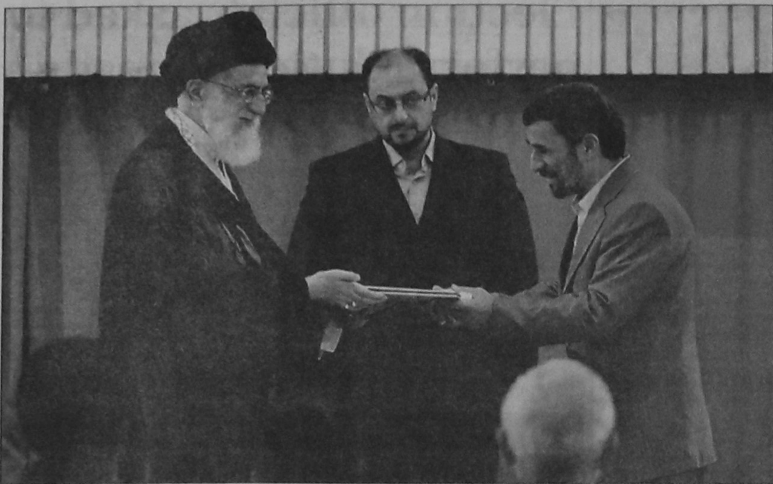
A picture released by the official website of Iran's supreme leader Ayatollah Ali Khamenei shows Khamenei presenting a decree to Iranian President Mahmoud Ahmadinejad (R) during an official ceremony in Tehran yesterday. Khamenei praised Ahmadinejad as he confirmed him in office and hailed the "unprecedented" vote that returned him to power.