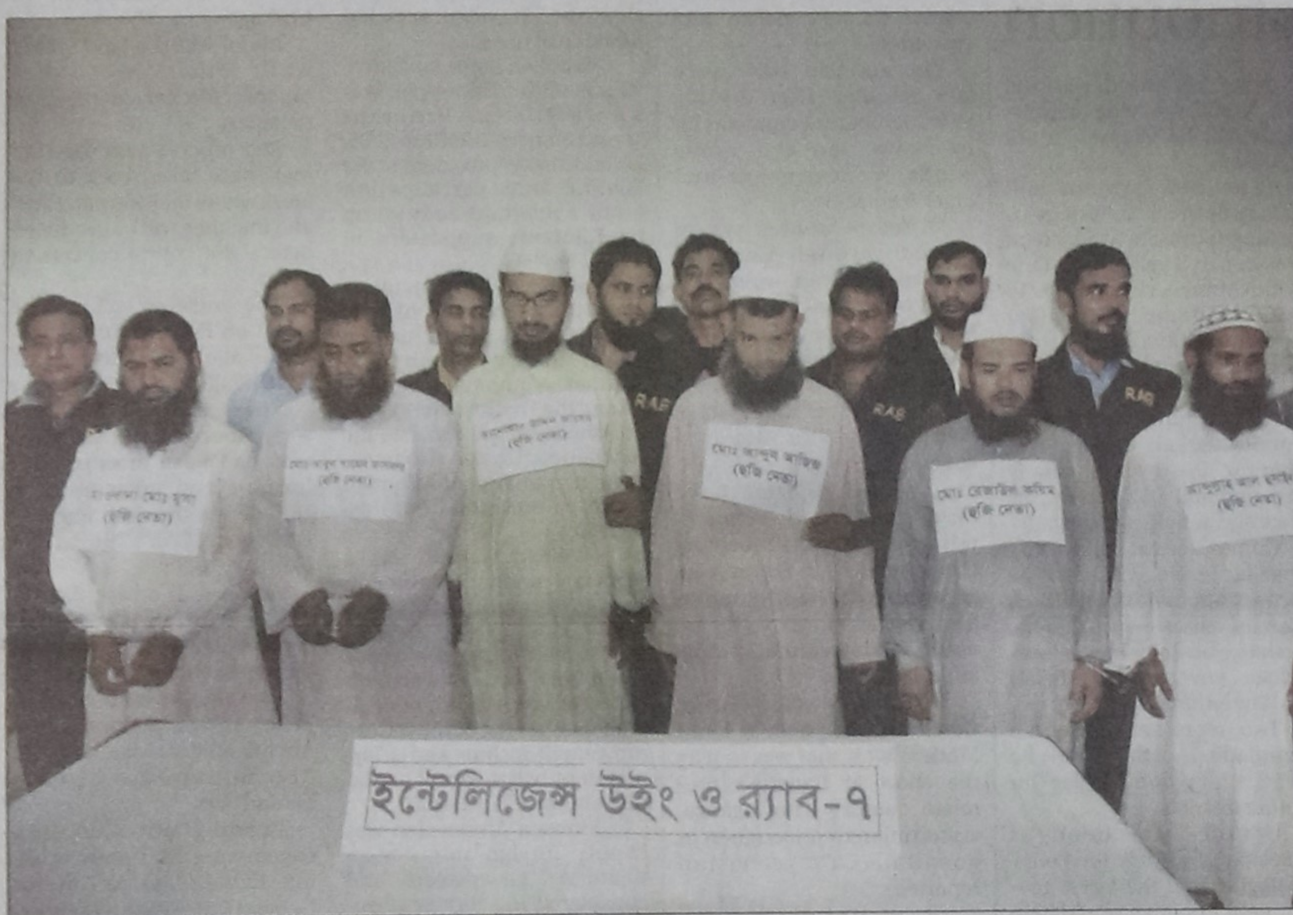
Rab-7 officials parade the arrested six accused members of Harkatul Jihad al Islam in front of journalists at its headquarters in Uttara yesterday. The six absconding men were arrested Saturday.