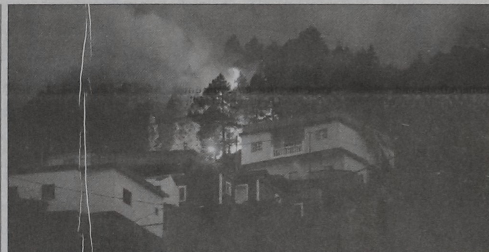
A forest fire ravages woods near the town of Tigalate on La Palma Island in Spain on Saturday. Some 4,000 people were evacuated from their homes on one of Spain's Canary Islands as forest fires raged out of control.