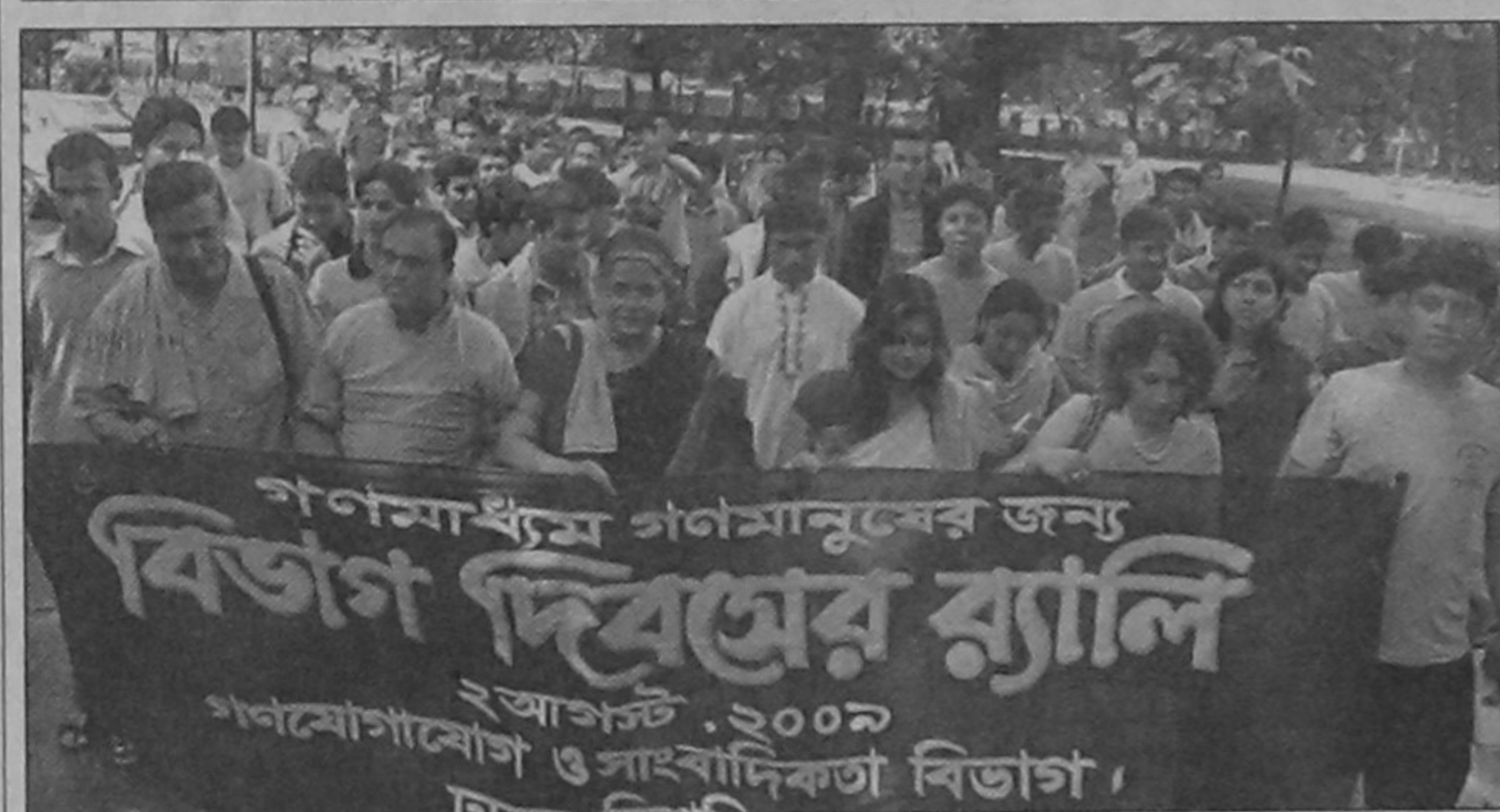
Mass Communication and Journalism Department of Dhaka University brings out a procession from in front of Aparajeyo Bangla on the campus yesterday to mark the Department Day.

The government says Uighurs, most of whom are Muslim, went on a rampage in Urumqi against members of China's dominant Han ethnic group.