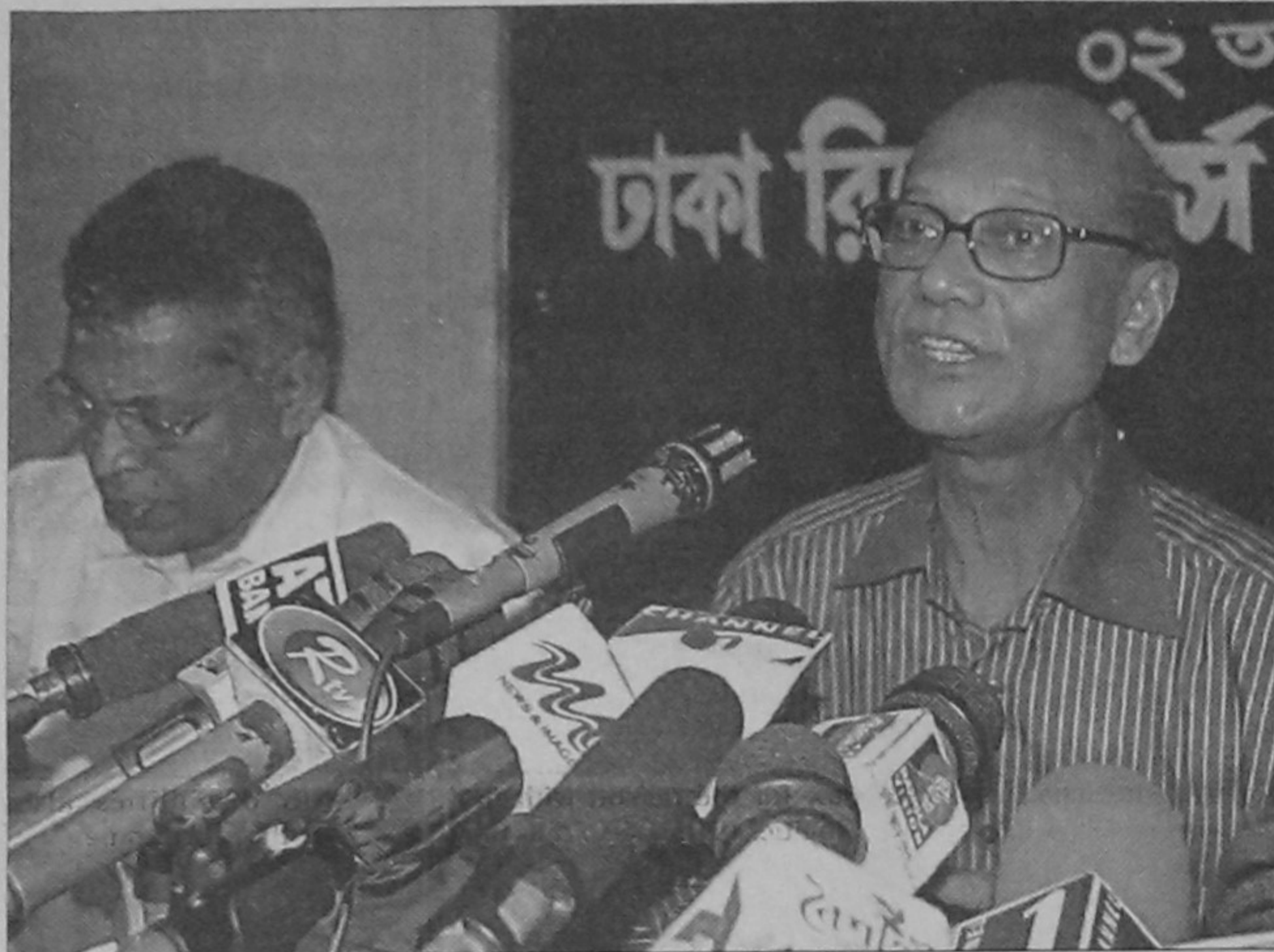
Education Minister Nurul Islam Nahid speaks at a 'Meet-the-Reporters' programme on 'Education system of Bangladesh' organised by Dhaka Reporters' Unity at its auditorium in the city yesterday.

Relatives, friends, admirers and students have been requested to pray for salvation of his departed soul.