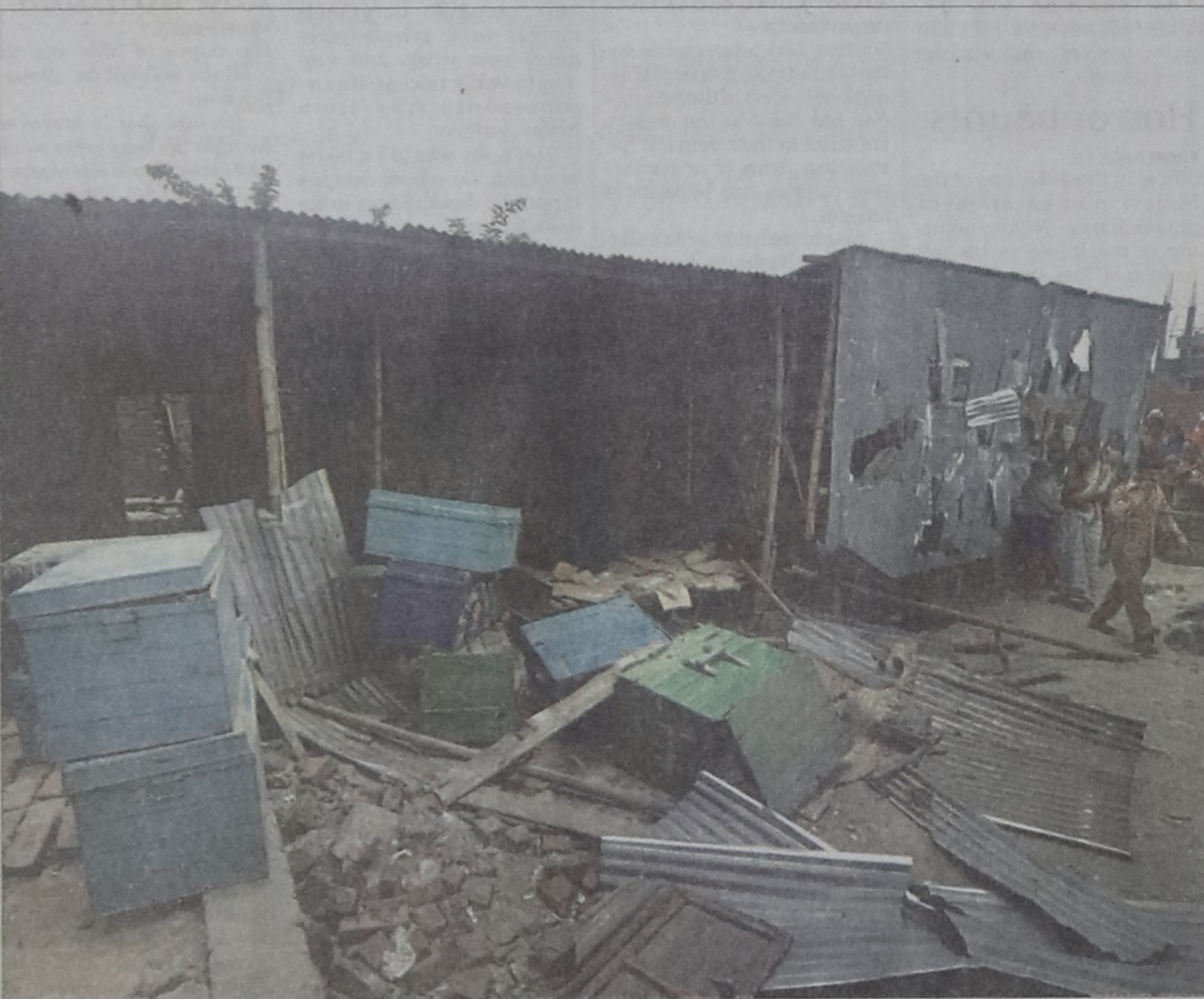
A group of Swachhshabak League activists yesterday attacked and ransacked the house of a resident in Kamrangirchar on the outskirts of the capital allegedly to evict them and occupy the house.