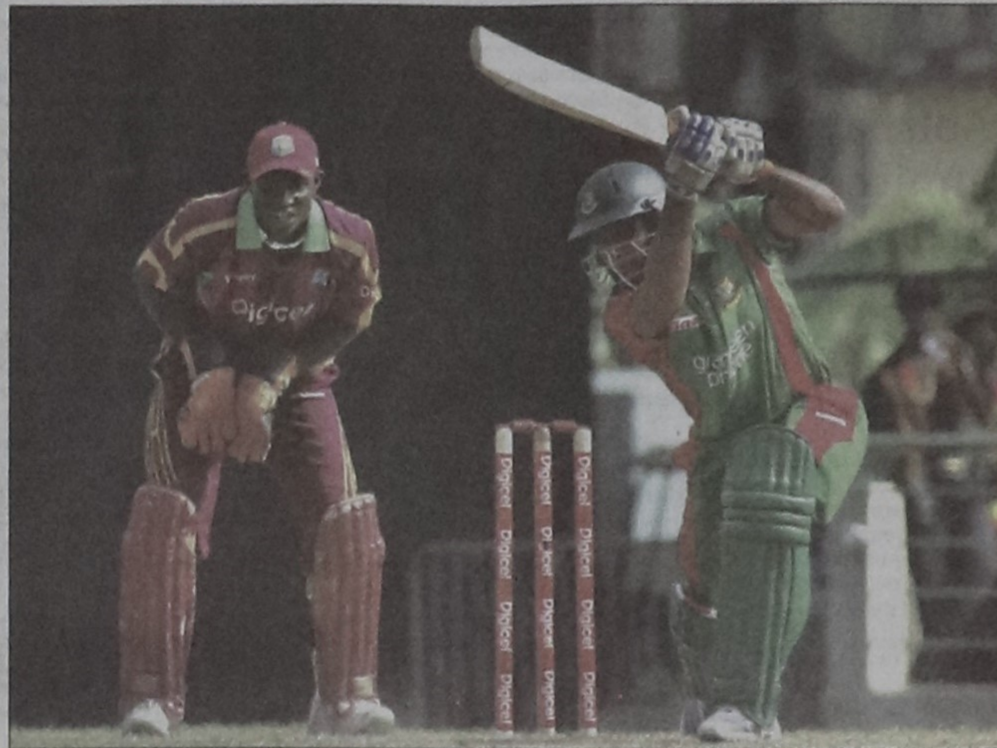
DRIVING TIGERS HOME: All-rounder Mahmudullah Riyad drives the ball on the off-side during his match-winning knock of 51 not out in the third and final one-day against the West Indies at Warner Park in St Kitts. Bangladesh won the match by three wickets and the series 3-0.