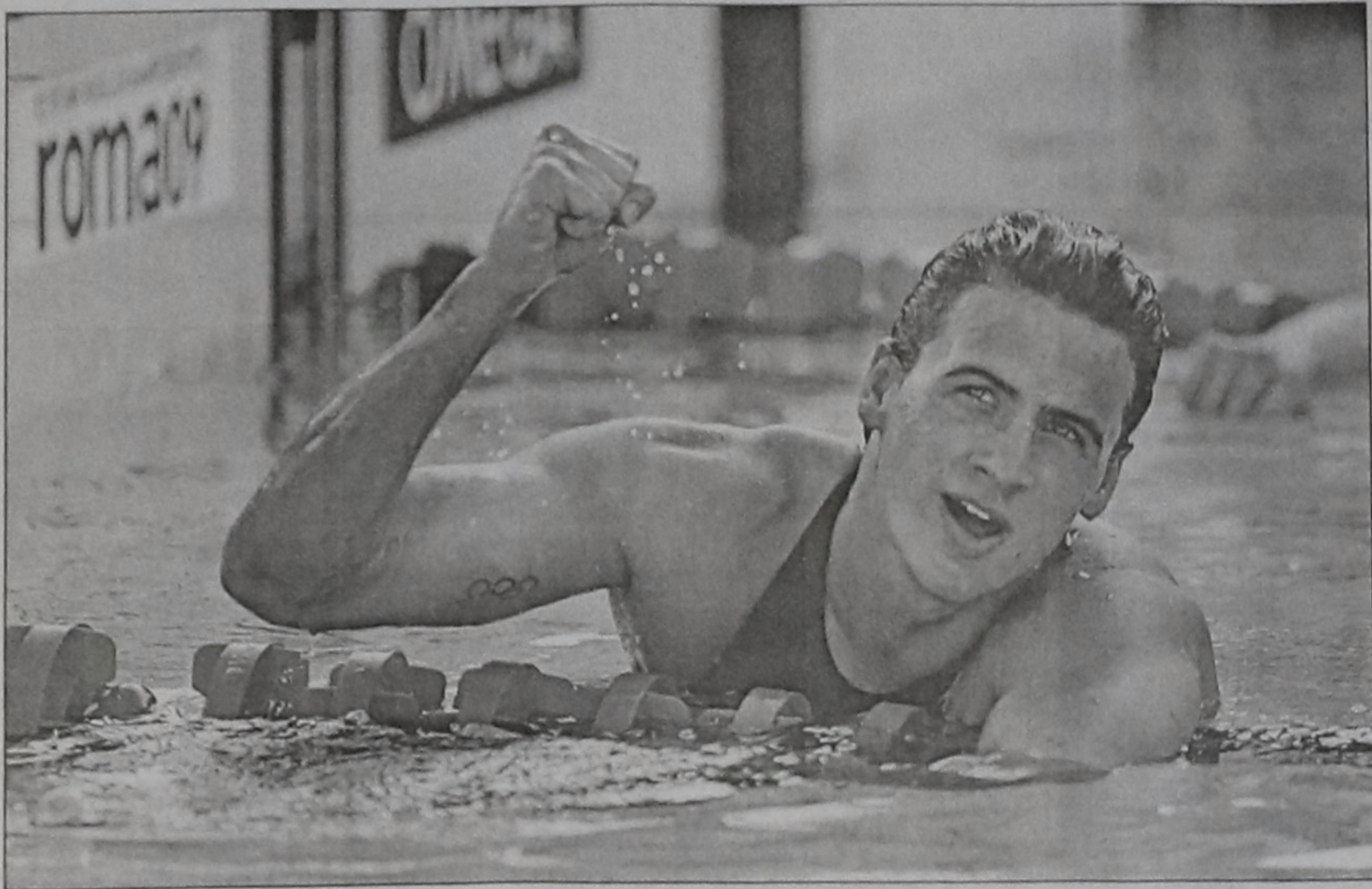
US swimmer Ryan Lochte celebrates after winning the men's 200m individual medley final on July 30, 2009 at the FINA World Swimming Championships in Rome. Lochte won the title in a world record time of 1min 54.10sec.