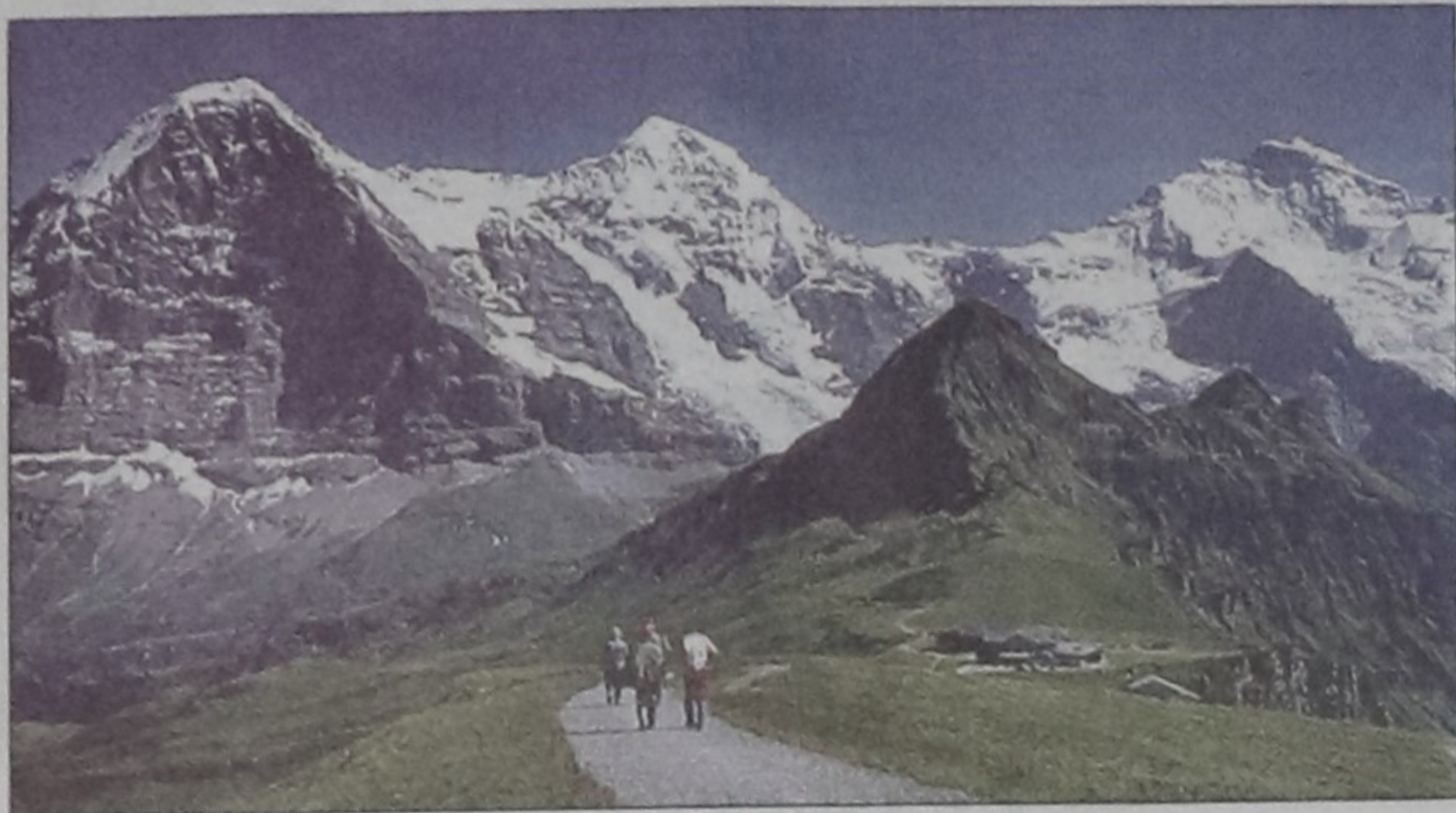
The Swiss Alps

CONTINUED FROM PAGE 12 and civil engineering achievements, in harmony with the surrounding landscapes.