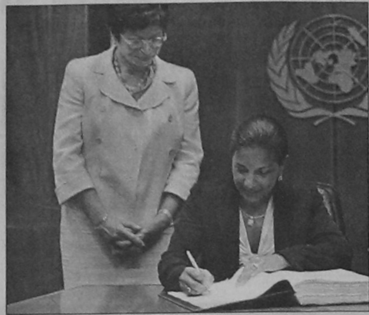
US Ambassador to the United Nations Susan Rice signs the United Nations Convention on the Rights of Persons with Disabilities while Valerie Jarrett, Senior Adviser and Assistant to the President for Intergovernmental Affairs, looks on at the United Nations in New York City Thursday.

The Obama administration recently eased trade sanctions against Syria in one recent gesture toward Damascus.