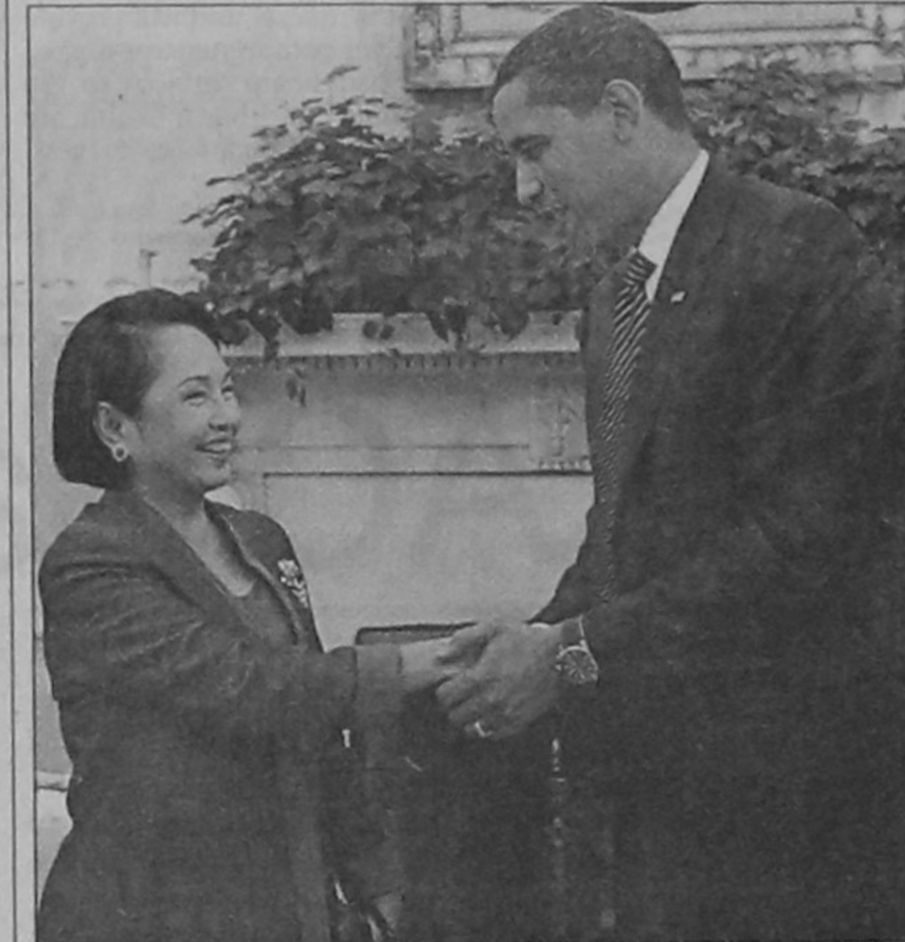
US President Barack Obama shakes hands with President Gloria Macapagal Arroyo of the Philippines during meetings in the Oval Office of the White House in Washington, DC, on Thursday.

Experts say that North Korea is seeking US recognition as a nuclear power -- particularly as leader Kim Jong-il's faltering health triggers a looming power struggle.