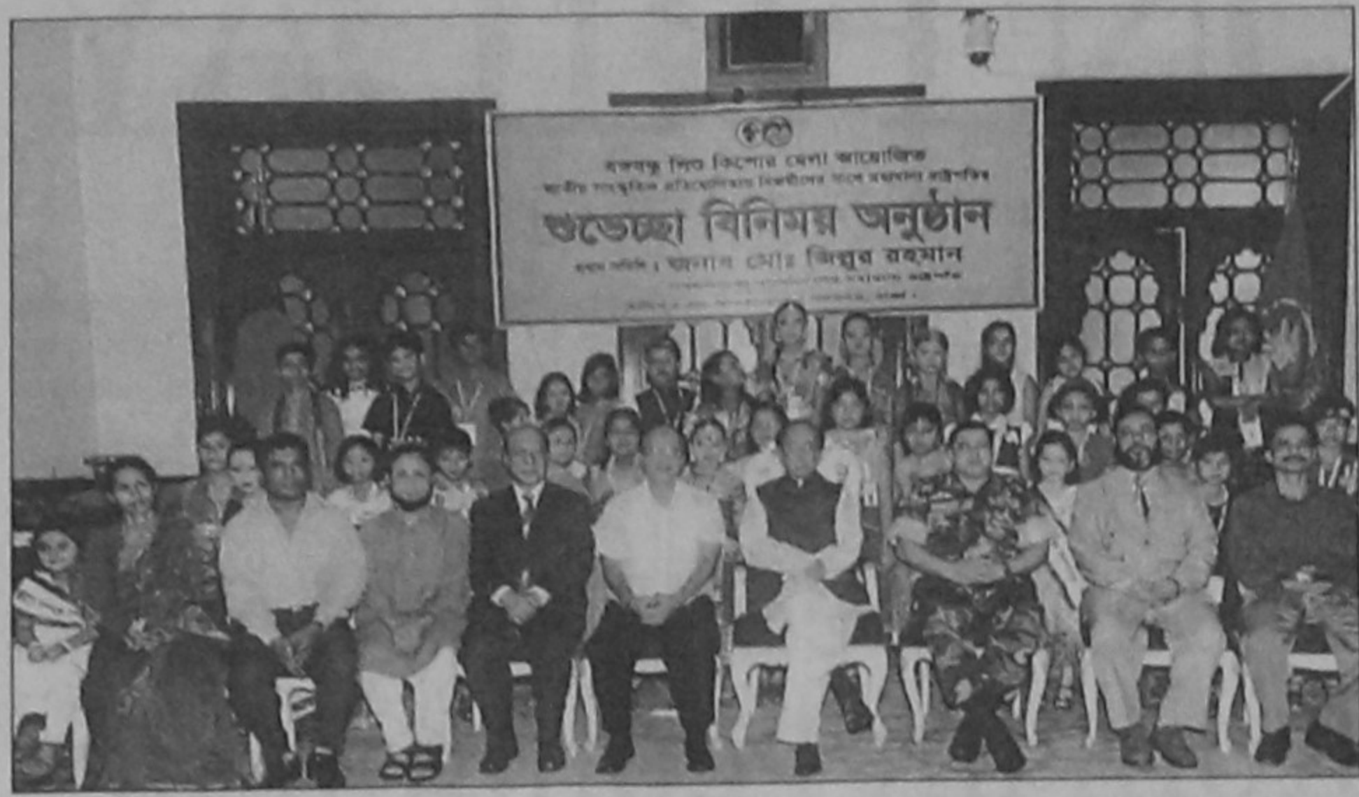
Winners of the national cultural competition of Bangabandhu Shishu Kishore Mela pose for photograph with President Zillur Rahman and other guests at Bangabhaban in the city yesterday. (Story on Page 3)