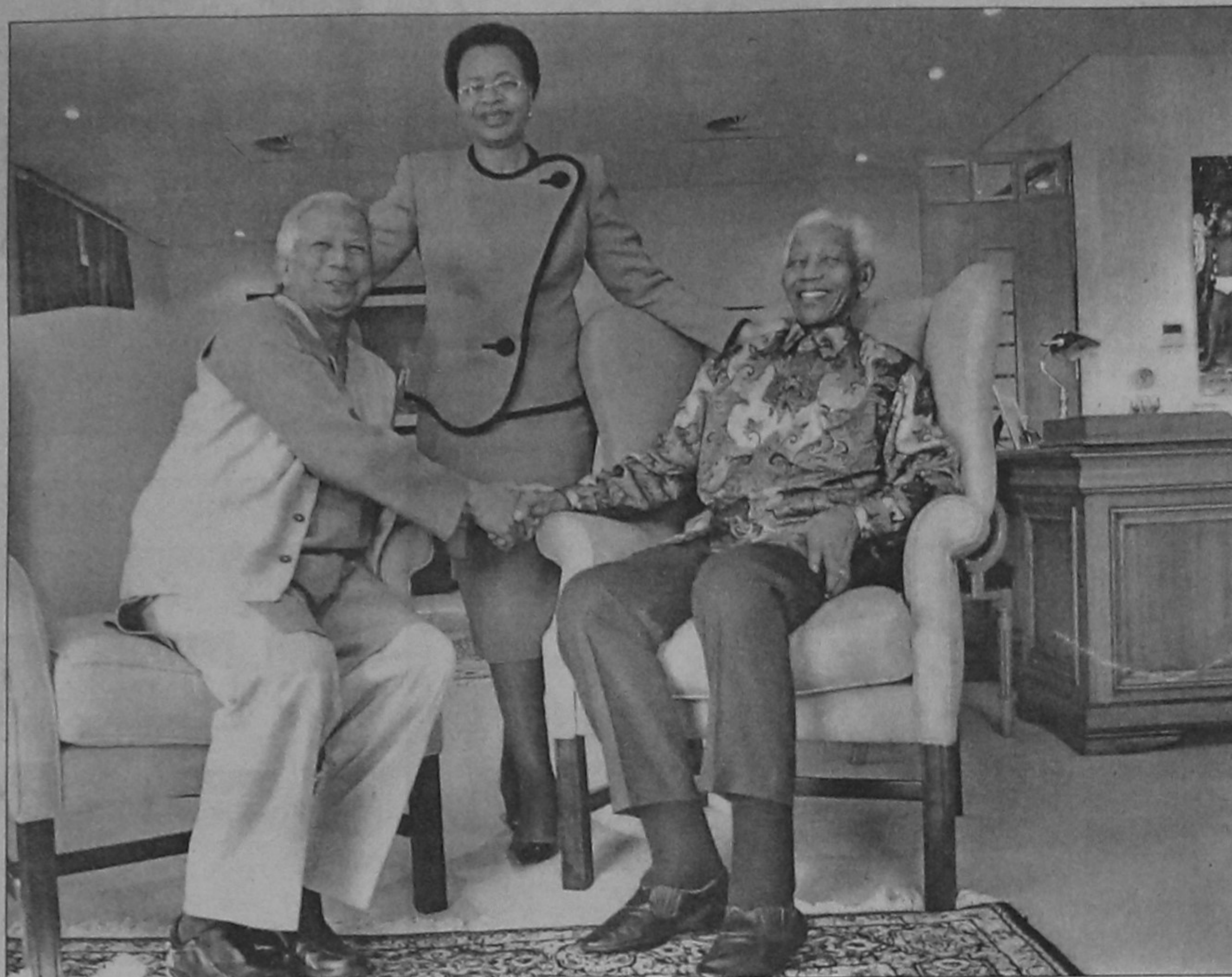
Professor Yunus meets Nelson Mandela and Graca Machel at the Nelson Mandela Foundation on July 10.

bank lend the money instead of the loan shark? But they rejected my idea and said it couldn't be done; they told me it was impossible.