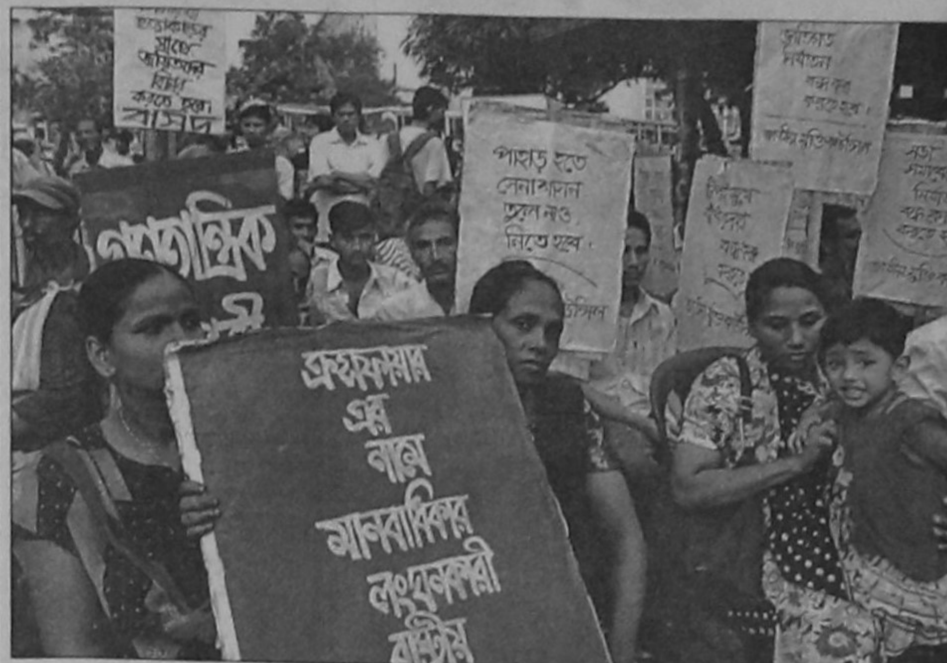
The National Committee against Fascism and Imperialism stages a demonstration in the city yesterday demanding judicial enquiry into all killings in crossfire.