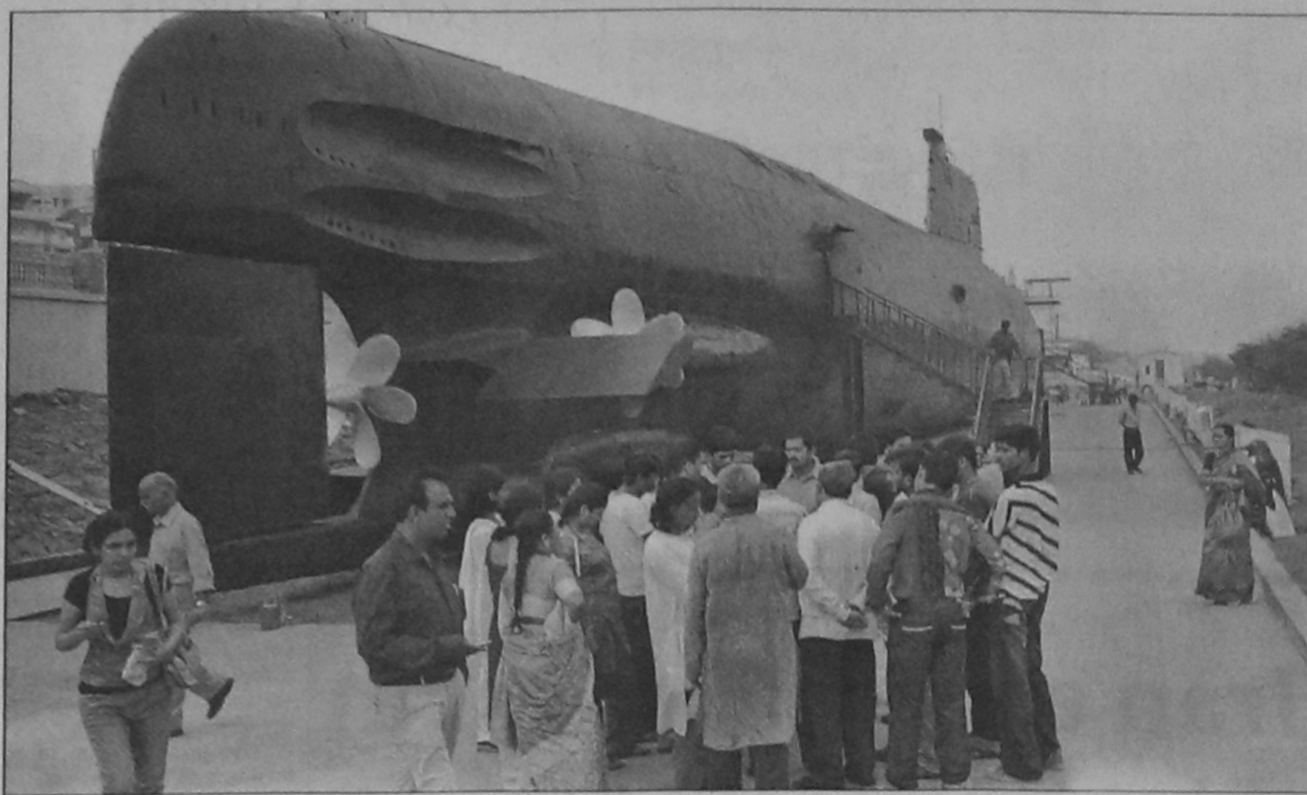
The INS Kurusura is put on display as a part of the INS Kurusura Submarine Museum at Rama Krishna Beach in Visakhapatnam, some 800km from Hyderabad, on Saturday. The Russian-built Foxtrot-class submarine, commissioned on December 18, 1969 and served in the Indian Navy until 2001, now serves as a museum ship on display. India's first Nuclear-powered submarine, the top-secret Advanced Technology Vessel (ATV) project, was launched by Indian Prime Minister Manmohan Singh on Sunday at the Visakhapatnam naval dockyard.