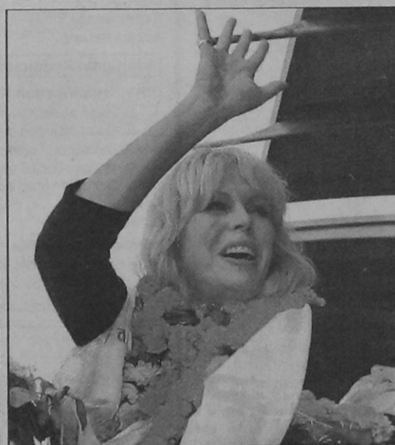
British actress and Gurkha campaigner Joanna Lumley waves to supporters as she arrives at the Tribhuvan International Airport in Kathmandu yesterday. Nepali Gurkhas gave Lumley a hero's welcome when she landed in Kathmandu on her first-ever visit to the Himalayan nation.

"They've created havoc, made our environment insecure, and wherever they are, we'll take them on," he said.