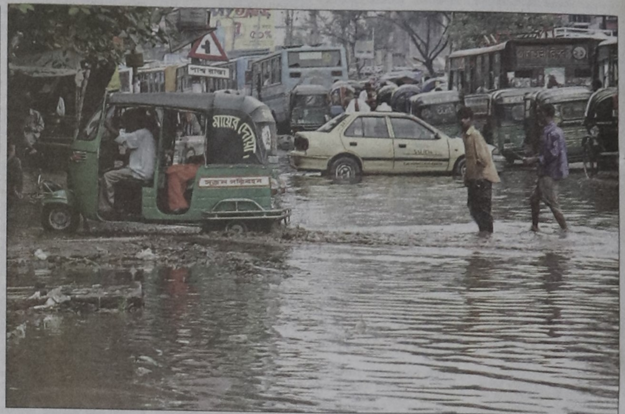
Water-logging due to heavy pouring yesterday caused immense sufferings to pedestrians and commuters in Jurain-Postagola area. Many other parts of the city experienced similar problem.