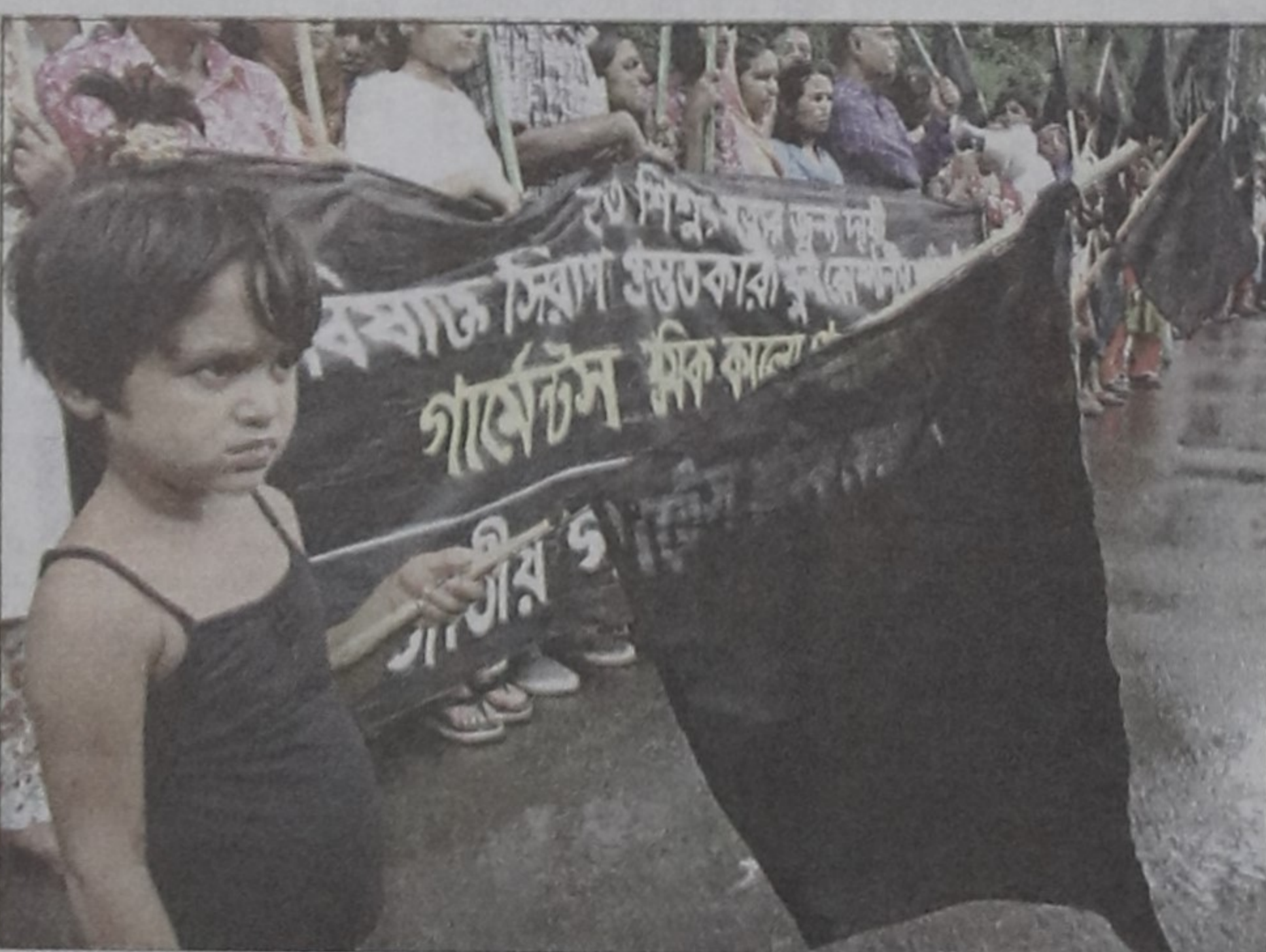
Jatiya Garment Shramik Federation forms a human chain in the capital yesterday demanding action against the manufacturer of toxic paracetamol syrup that cost lives of 25 children.