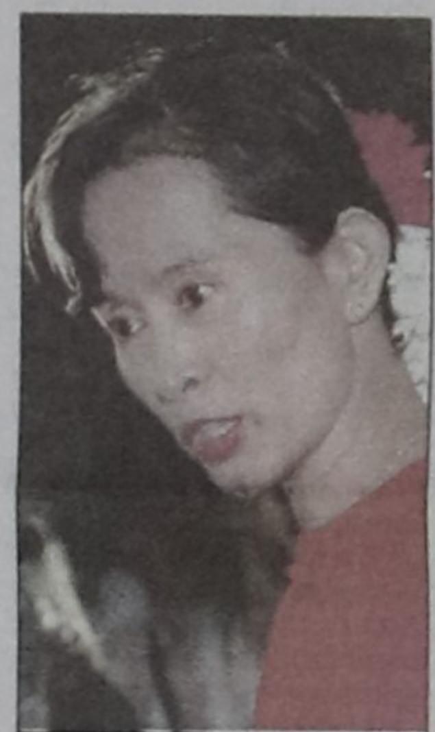
Aung San Suu Kyi

Myanmar officials speaking on condition of anonymity said SEE PAGE 15 COL 7