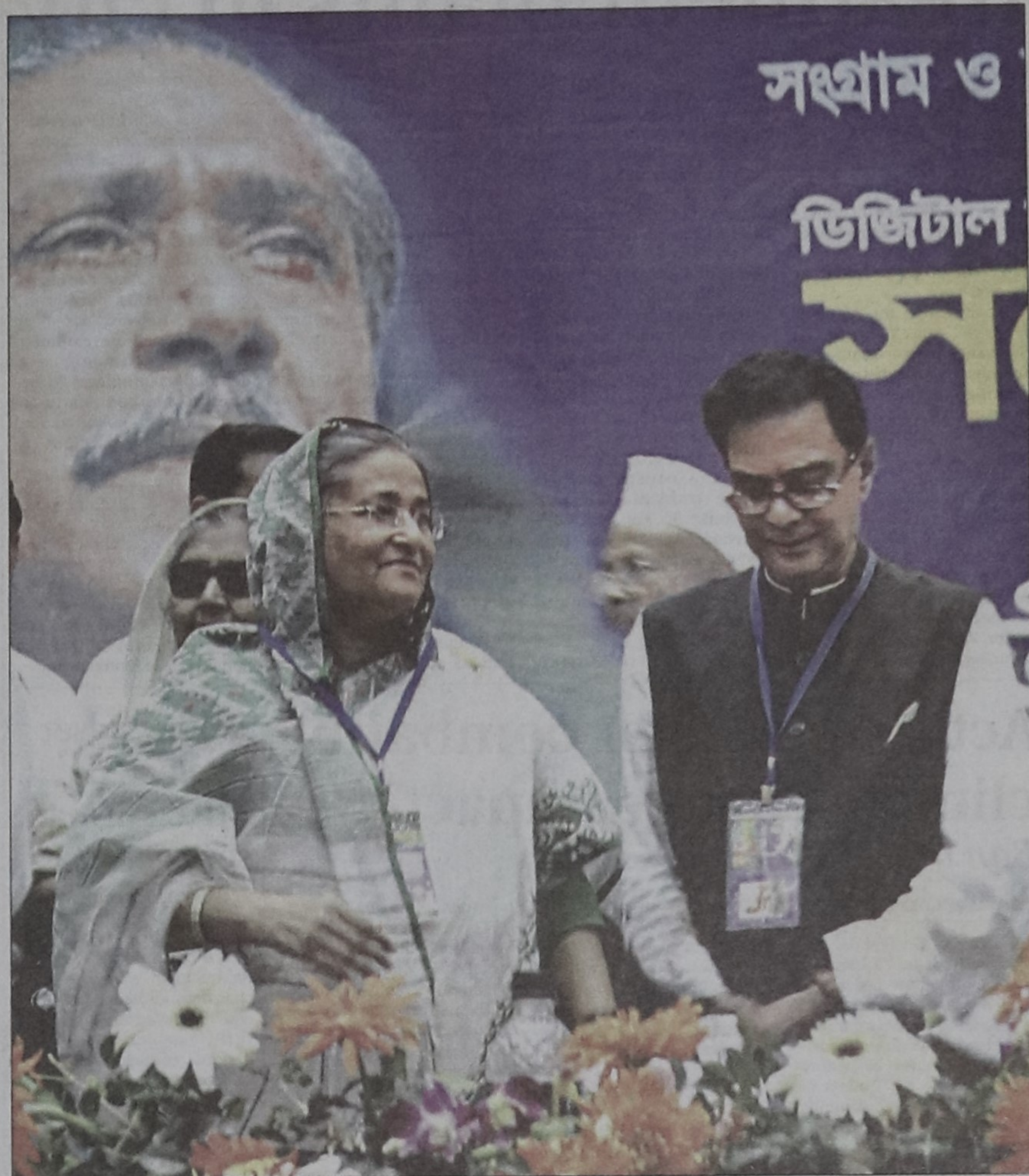
Awami League President Sheikh Hasina with newly elected general secretary Syed Ashraf Islam at the inaugural session of 20th AL council yesterday. (More pictures on page 5)