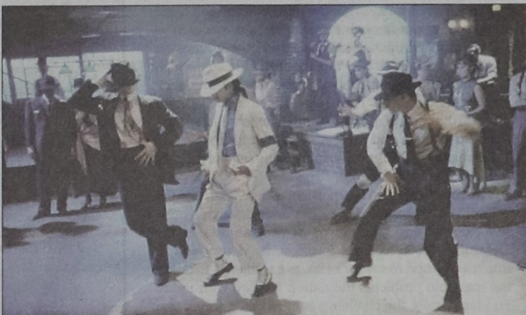
A scene from the film "Moonwalker".

The 93-minute film is jointly directed by Jerry Kramer and Jim Blashfield. Jackson played his own character. Jeff Adkins, Patrick Alan and Dante Basco are the other cast members of the film.