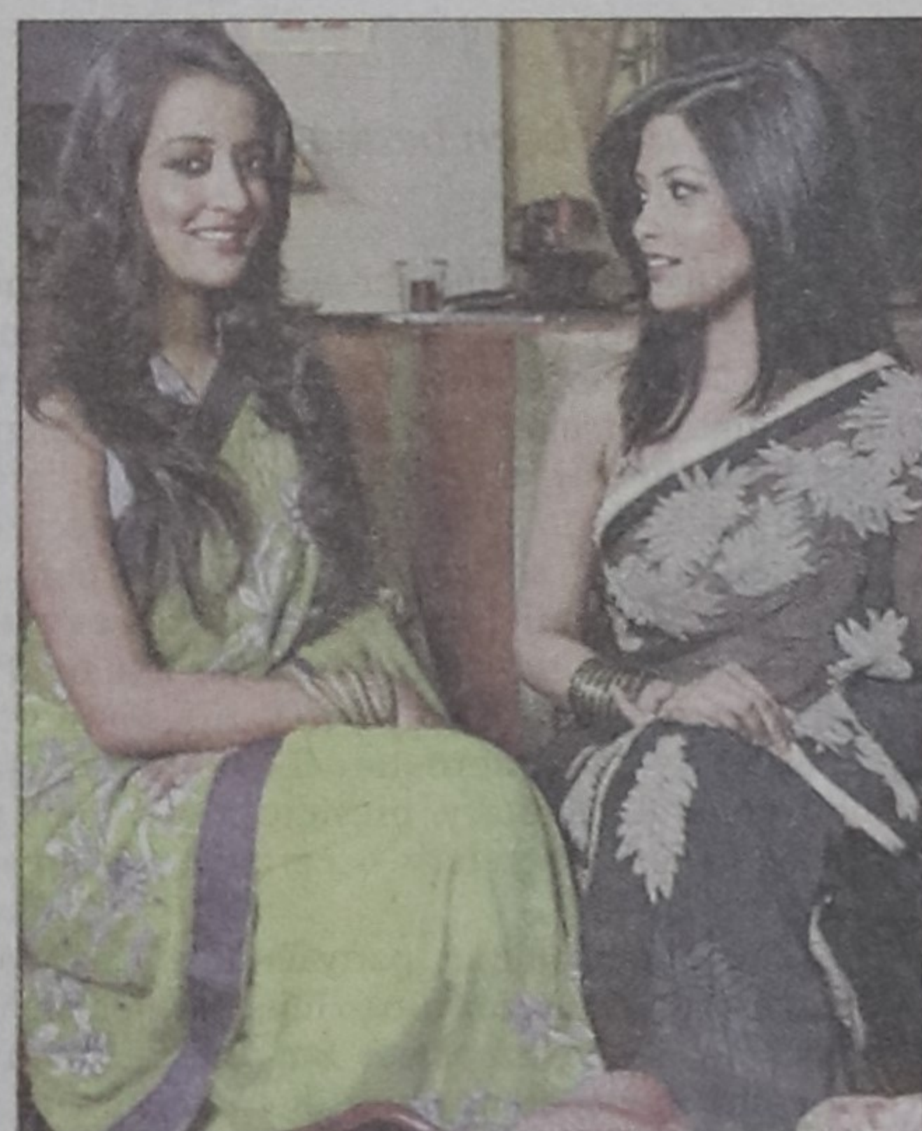
Raima (left) and Riya Sen.

Apart from Raima and Riya Sen, the film also stars Jishu Sengupta, Priyanshu Chatterjee and Sharmila Tagore. Riya plays Kamala and Raima is Hemmalini.