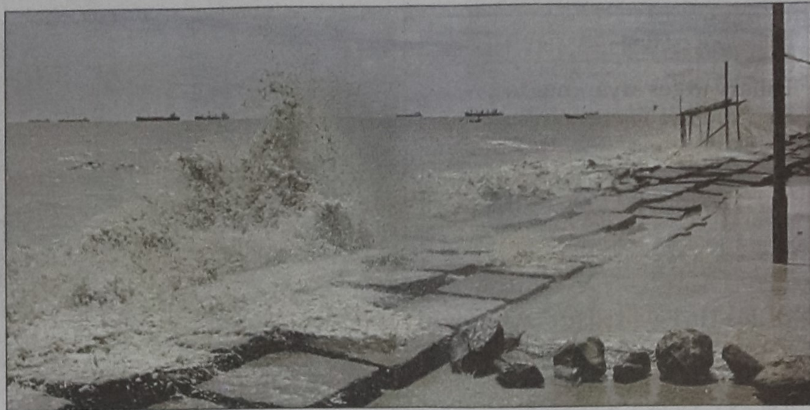
Coastal areas at Patenga in Chittagong experience high tide yesterday following depression in the Bay.

They called on the countrymen to cast their votes wholeheartedly in the final round.