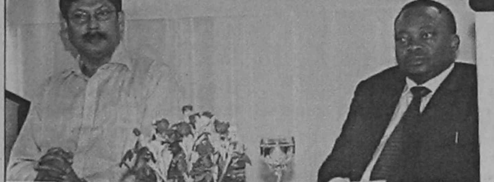
Commerce Minister Faruk Khan speaks at the inaugural ceremony of a three-day national workshop on WTO Notification Procedures and Obligations, organised by Bangladesh Foreign Trade Institute in Dhaka yesterday. (Story on B1)