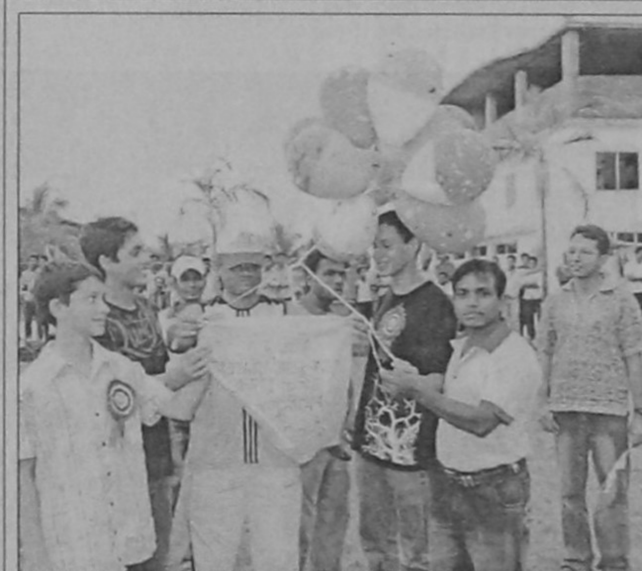
Students and guests jointly inaugurate the second ZH Sidker Football Tournament at the Millennium International School and College ground in the city yesterday.

Zhigatola Salek Garden and Tally office Eagle Sporting club faced off against each other in the opening match.